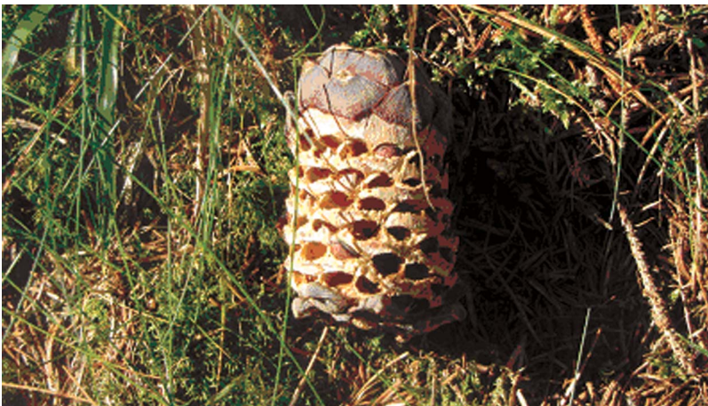
Fig. 1. — P. cembra cone discarded by Nutcracker after removal of seeds for feeding and/or caching.

Based on MVT, increasing prey availability or value and decreasing search and handling costs should decrease the optimal time spent feeding on each item (SCHOENER 1971). An item’s value should be its maximum possible net energy intake per unit handling time rather than the intake rate from consuming an entire item (SIH 1980). In this case, each Arolla pine cone can be viewed as a patch, and assuming that nutcrackers should try to maximise rate of energy intake and minimise time necessary to obtain nourishment by leaving the cones with edible seeds in the distal part, we predict that (1) nutcrackers will use all seeds from a cone in years with a poor or average seed production, but will take only the heavier seeds from each single cone during a mast-crop. If this is the case, we further predict that in a mast-crop (2) total seed mass and seed kernel mass will be higher for seeds from the basal part than from the distal end of a cone. Third, the proportion of aborted seeds (undeveloped seeds containing only the seed coat, thus without edible embryo), a cone-trait which acts to deter predators (e.g. BENKMAN 1995; BENKMAN et al. 2003), is likely to be higher in the distal part of cone than in the rest of the cone (HAYASHIDA 2003).