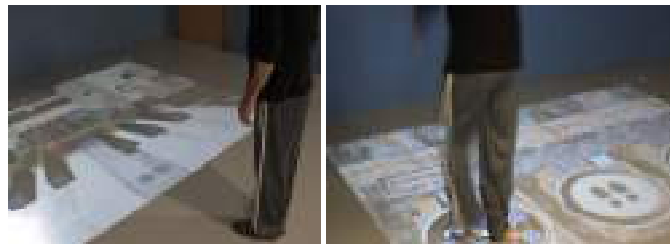
Fig. 1. A player exercising with the floor projection installed in a local senior gymnasium.

senior gymnasium, where lights and privacy were controlled.