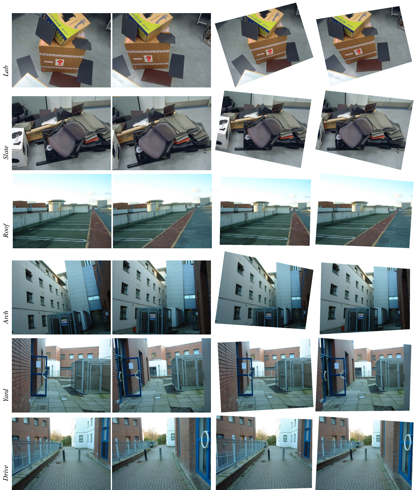
Fig. 4 VSG images [16]. Original pair (left) and quasi-Euclidean rectification (right).