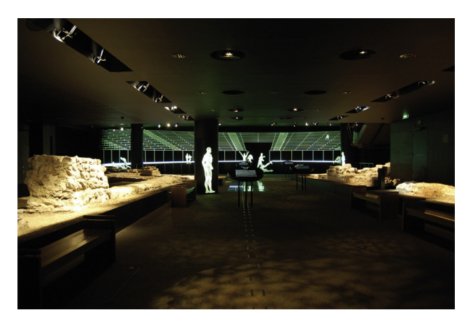
Fig. 3. London: lighting in London's Roman amphitheatre.

The roman amphitheatre of London was built in 70 AD. The display structure is about six meters under the square of the Guildhall Yard Art Gallery and the original wall is still visible along with the entrance from which gladiators, slaves and animals came into the arena. The presence of an advanced culture has archaeological, architectural and museographical implications. Therefore, the intervention strategy offered the possibility to conserve and properly show the original artifacts, including even a few of the original wooden fragments (Fig. 3). The intervention was conducted in 2004 by the London based firm Branson Coates Architecture. Their work concentrated on creating perspective effects, providing a remarkable charm for the visitor and recalling the dramatic and tragic atmosphere of gladiatorial games. The aim of the project was to study and reveal several aspects of Roman practices and traditions.