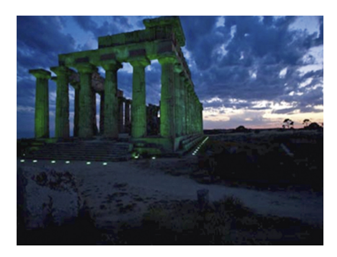
Fig. 4. Selinunte, Archaeological Park: Temple E.

This enabled a material and immaterial rebuilding of the environment, through the use of wireframe projections on the restored wall, with particular attention to the conservation and preservation of the original artifacts [8]. The shapes of gladiators, the stairs of the arena and the background of a cheering crowd recreate the magnitude of the amphitheatre. Lights and sounds do not distract the visitor, who is emotionally involved in the show. This intervention is an essential reference to show how projections can be employed as metaphors of an innovative restoration process involving the use of advanced technology.