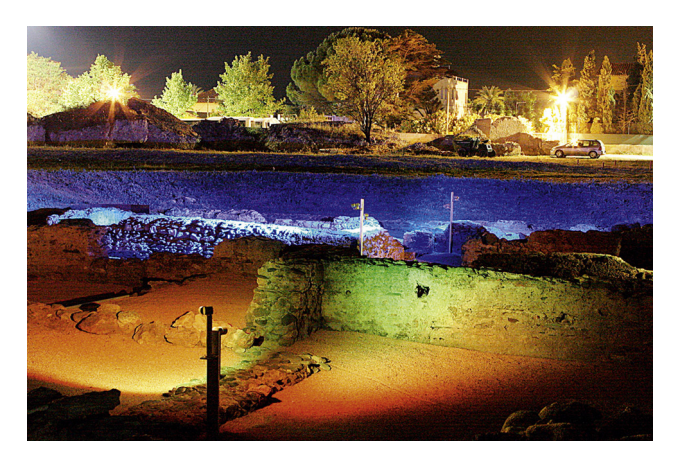
Fig. 2. Roses, Ciutadella: Roman and Greek Settlement ruins illuminated by LED equipment.

This case represents an example of good lighting practice in which light is used to serve different purposes such as showing different historical periods and building remains as well as indicating the location of Roman baths and highlighting some architectural