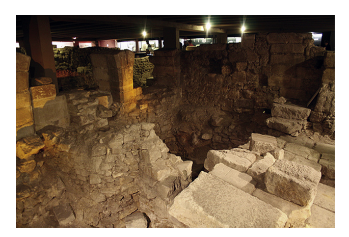
Fig. 1. Paris: archaeological crypt of Notre Dame.

sensitivity to light and their visibility. However, an outdoor archaeological site exposed to the sun and other environmental elements will probably suffer more damage when compared to an indoor site. Therefore, additional preventive measures must be taken into account for the outdoor site relative to its indoor counterpart since the former one has higher exposure to the elements. Colour temperature, colour rendering index, luminous intensity, luminous flux, illiminance/luminance, light exposure, quantity of ultraviolet radiation and luminous efficacy are the units, which inform us about the lighting characteristics [5]. Much of the variation in people's perception of whether light fading is a risk or not arises because this range of sensitivity is so dramatic – some colours in old objects that look fragile can indeed last many centuries, while some colours disappear within our own lifetime, or even in just a few years.