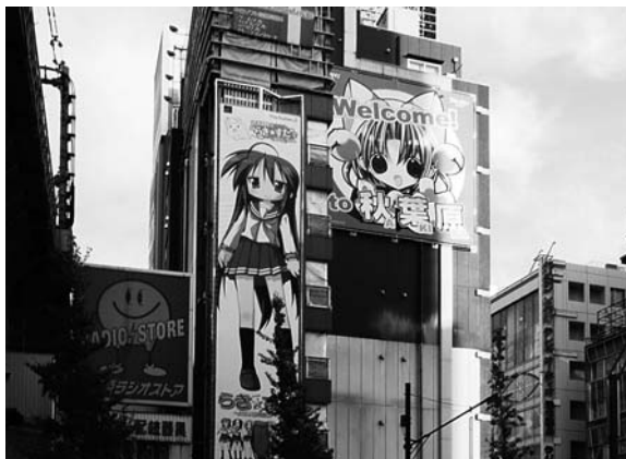
Fig. 3: Otaku icons

From an architectural stand point, this may seem like it had only to do with the content of posters and such advertisements. Not so. To show you in comparison, we shall now take a look at another subcentre in Tokyo; Shibuya, which is located on the opposite side of the circle line. Shibuya, as opposed to Akihabara, is more a general commercial district, with department stores, boutiques, and restaurants. And when we look at these commercial buildings, we notice that they are becoming more and more transparent. This is an extension of modernism. A eurocentric, global trend in architecture.