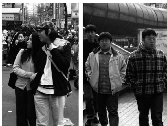
Fig. 6: Myongdon people (left) and Yongsan equivalent

We made a give-away figurine to accompany the catalogue. It depicts Akihabara in the form of a souvenir miniature. At the show we displayed this with souvenirs from other cities. Usually, these kind of miniatures cannot be made to depict modern cities; they are all from historic cities, with distinguished architectural styles of their own. Akihabara is made out of boring modern architecture. Nothing historic nor symbolic whatsoever. But the concentration of otaku personality has made Akihabara acquire a distinguishable streetscape, enabling it to be depictable in the form of a souvenir miniature. This is a totally new channel by which a city acquires such character, which until then were derived from history and traditions.