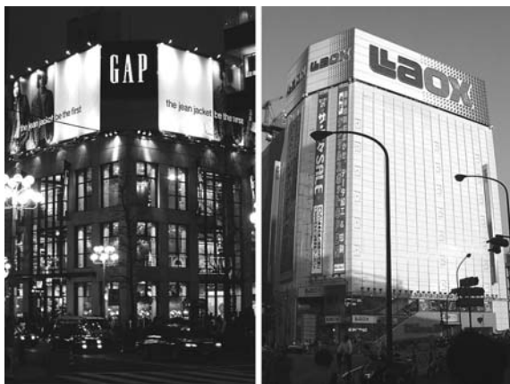
Fig. 4: Shibuya department store (left) and Akihabara equivalent

This now, is not just a phenomenon local to Akihabara. In Seoul in Korea, there is an electric town by the name of Yongsan. We see there the same kind of culture collecting, as well as otaku persona-