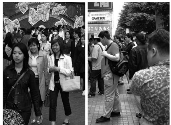
Fig. 5: Shibuya people (left) and Akihabara equivalent