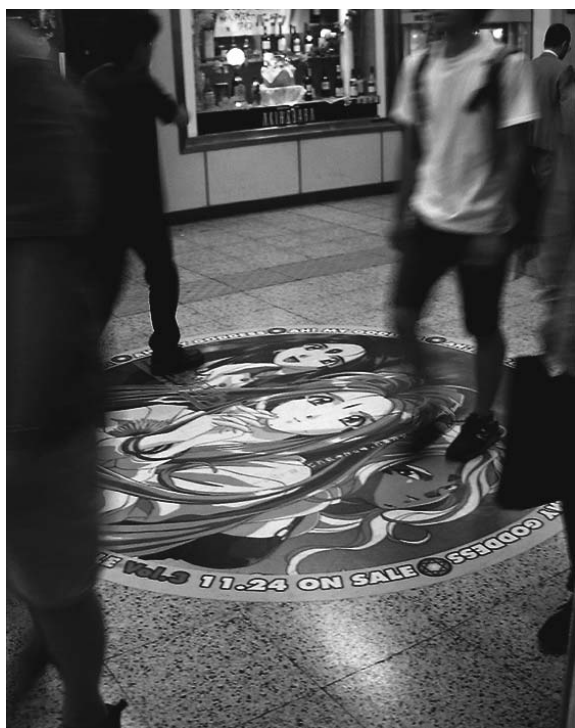
Fig. 8: Otaku figurine, Venice Biennale of Architecture, 2004

Taste and personality are becoming a geographical phenomenon. This is not just a "matter of taste" anymore.