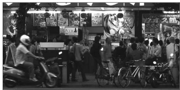
Fig. 2: Otaku icons

Otakus were, by nature, once-ambitious boys, who were particularly affected by the loss of faith in science and technology. They used to adore science, and technology, but when America had to shift their resoures from space exploration to the Vietnam War, and scientific future abruptly started to fade, their worship shifted from science to