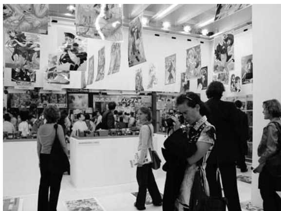
Fig. 7: Otaku exhibition, Venice Biennale of Architecture, 2004