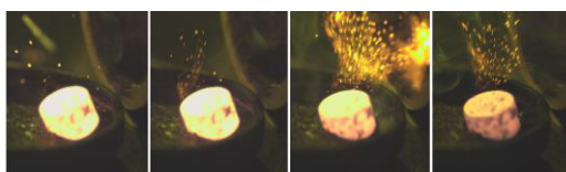
Fig. 3. Video frames of CWS containing petrochemicals ignition by hot particle.

Video frames of ignition are presented in fig. 3 during interaction process of hot particle with CWS containing petrochemicals.