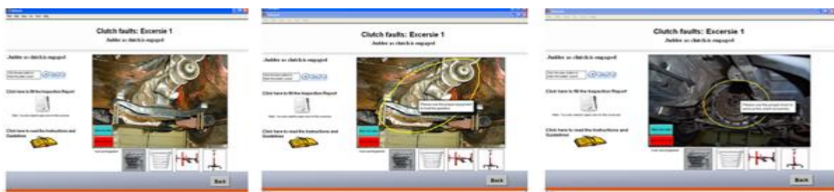
Remove the gearbox with proper tools and dismantle the clutch components