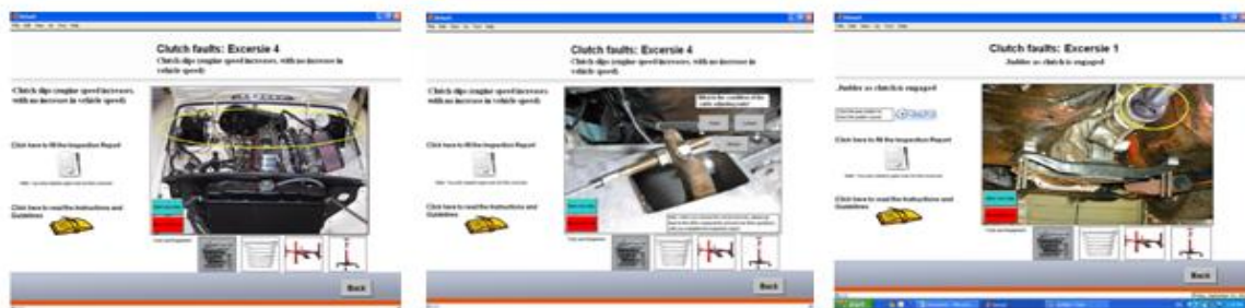
Chuck the condition of the clutch cable adjusting nuts and remove the propeller shaft

Figure 2 and 3 shows typical screen shots of the tutoring software (e.g. video clips, drawings, 3D models, images, photos and drawing) to cover mechanical engineering course (Automotive Clutch).