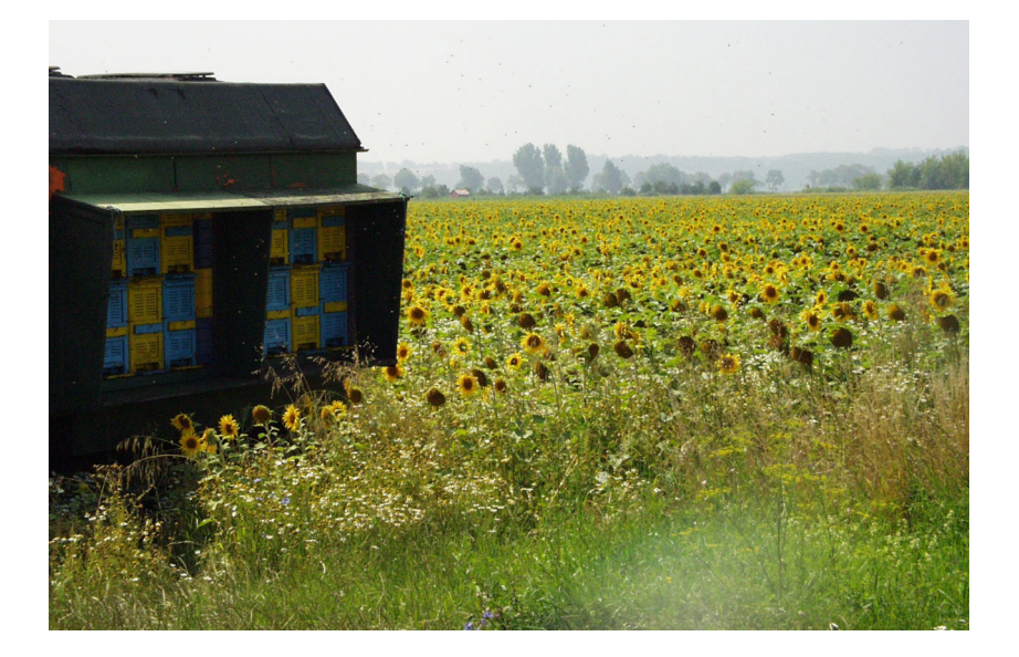
Fig. 8 Principle 5–Protecting honeybees is one criterion used for pesticide selection

Maize-based cropping systems offer an illustration of the importance of crop rotation. Continuous maize cultivation is widespread in Europe for grain production as well as for silage and energy production. Rotation has been demonstrated as key to reducing reliance on pesticides while allowing the successful management of the invasive Western corn rootworm Diabrotica virgifera virgifera as well as several noxious weeds (Vasileiadis et al. 2011). In Europe, the Western corn rootworm can be considered as a pest of a specific maize cultivation system because the complete egg-to-adult development of the pest extends through two maize cultivation cycles. When maize is rotated with a non-maize crop, the cycle of this pest is broken and its population decreases to minimal levels. Because of the multiple on-farm uses of maize