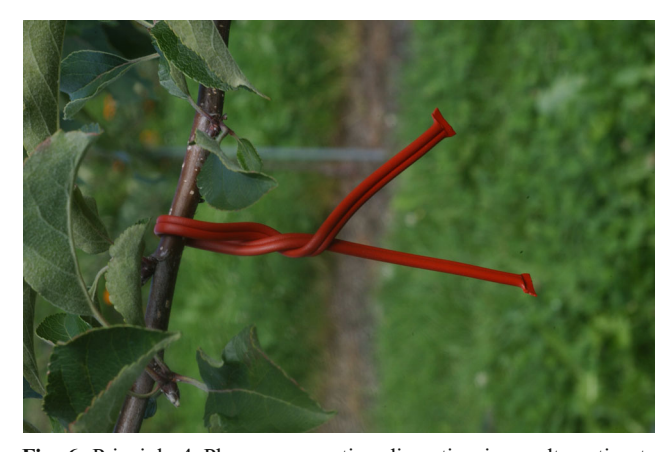
Fig. 6 Principle 4-Pheromone mating disruption is an alternative to chemical control against several lepidopteran pests of fruit

Spatial and temporal diversification is key to minimizing pest pressure and achieving effective prevention. In organic arable crop farming, crop rotation is the most effective agronomic alternative to synthetic pesticides (Fig. 4). In annual crops, the manipulation of crop sequence to break the life cycle of pests through rotation with crop species belonging to different