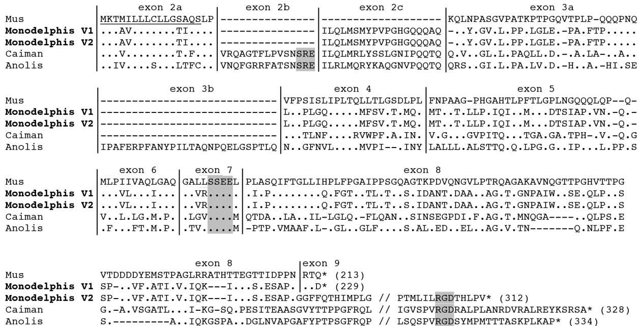
Fig 1. Amelotin sequence alignment. The two main AMTN variants (V1, V2) of Monodelphis domestica are aligned with rodent ( Mus musculus ), crocodile ( Caiman crocodilus ) and lizard ( Anolis carolinensis ) sequences. Functionally important motifs (SxE motifs encoded by exon 2b and exon 7, and the RGD motif encoded at the end of exon 8) are highlighted in grey. Signal peptide underlined; sequence length indicated in brackets; exon limits indicated by vertical lines; (:): residue identical to M. musculus AMTN residue; (-): indel; *: stop codon. (//): for convenience of presentation the sequences were shortened.