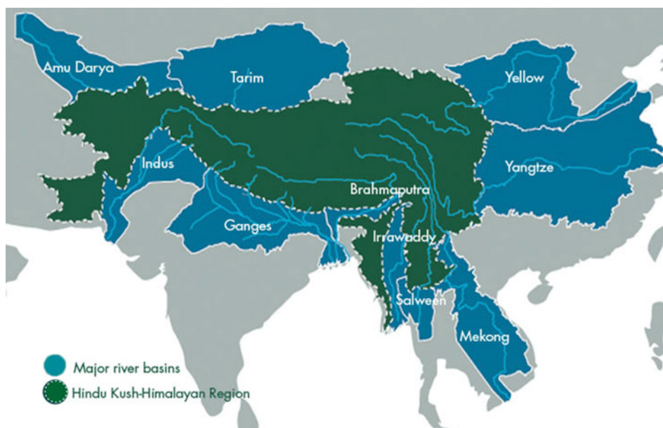
Figure 1. The Hindu Kush Himalayas region and the 10 river basins emanating from it.

common. While understanding the science of river hydrology and glaciology is very important in the context of the HKH given the primacy of rivers, snow and glaciers, it is equally important to understand the local-level water issues facing the mountain communities. This is because decisions that affect access to water for the people of the HKH are rarely made at the river-basin scale but are forged at local levels. A balanced understanding across scales, from the river-basin scale to the micro-watershed scale, is needed if we are to arrive at a comprehensive understanding of the challenges and opportunities offered by the Himalayan waters. This cross-scale understanding must also be set in the context of the vast socio-economic and demographic changes taking place in the mountains, which face numerous drivers of change, including globalization, urbanization, out-migration and feminization of agriculture, in addition to climate change.