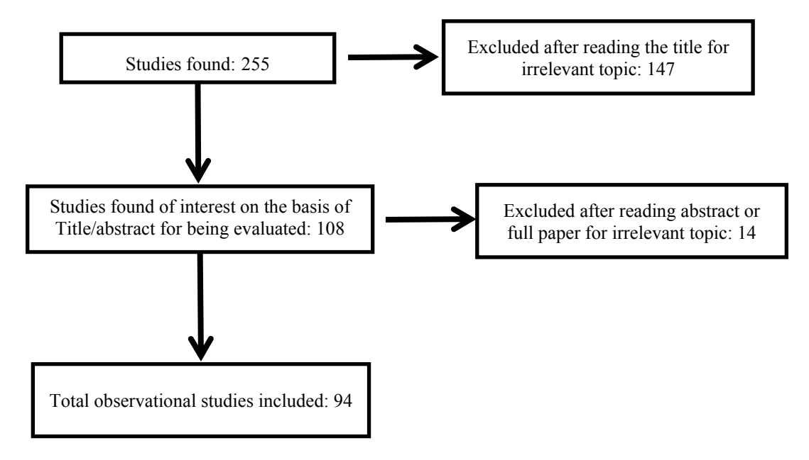
Figure 1. Flow diagram of study selection process.

cross-sectional study, meta-analysis (none)), written in English and reporting on non-accidental health impacts of wildfire. Figure 1 shows a flow diagram describing the study selection process.