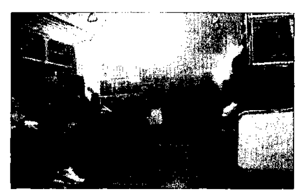
Figure 2 illustrates the burn out process that affected most of carriages of the trains affected by the fire.