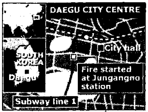
Figure 2: location of the fire in the city of Daegu, 3<sup>t</sup> town agglomeration of Korea

The accident took place on the 18<sup>th</sup> of February 2003, close to 10 a.m., at the level of the Jungangno station of line 1 linking Daegu Si to Jung Gu Namil Dong (see figure 2), comprising 30 stations in total.