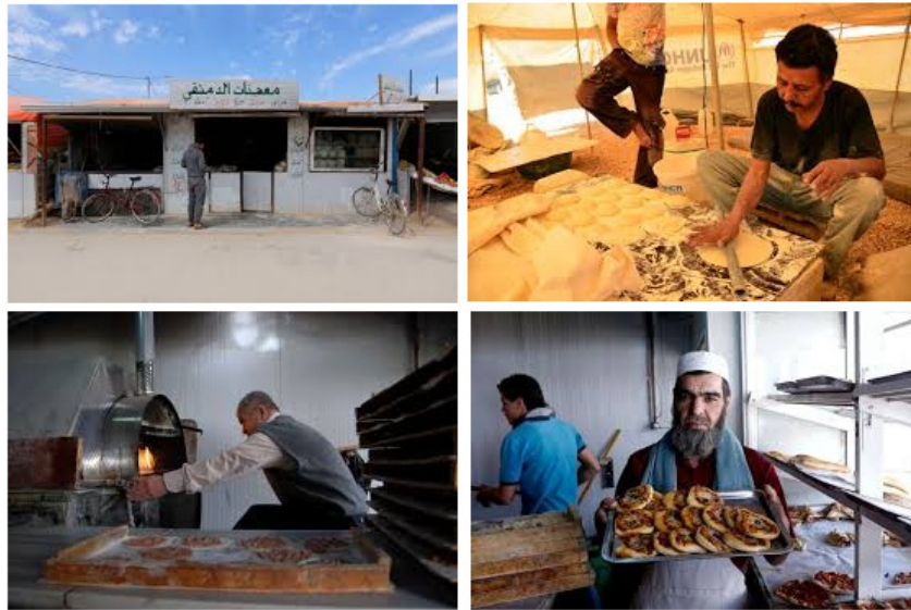
Figure 2. Economic activity within the camp.

The NGOs, government agencies and wider stakeholder groups made tremendous efforts to help with the evolution of the camp and to deal with the often chaotic, changing needs and focus within the camp community.