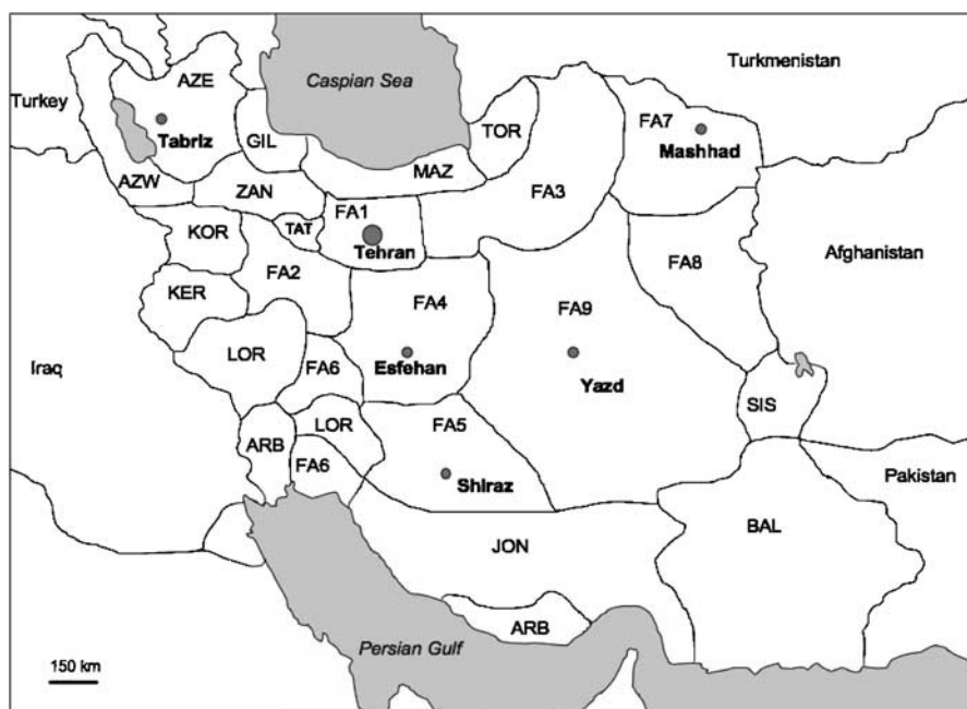
Figure 1 Sampling information. Population codes and sample sizes ( n = number of individual samples collected in each locality) are as in Table 1 ('KOR': Kords from Kordestan, not included in present study). The large dot represents the capital, Tehran (> 10 million inhabitants), smaller dots are large conurbations \geq one million inhabitants. Borders in the figure roughly correspond to cultural regions based on ethnicity and language (see Ethnologue homepage for more information).

Figure 2 illustrates the percentage of randomly sampled individuals from each locality whose grandparents and/or parents were born in the same area, compared to those individuals that were born in the sampling locality, but whose parents or grandparents were born outside the area ('immigrants'). For simplicity, if the sampled individual and their grandparents were born in the same locality, it was assumed that the parents were also born in that locality (this was the case for all but three individuals in the whole sample set). Patterns of immigration in the last three generations are similar for female and male individuals (Figure 2a and b, respectively), although there is a very slight tendency for male subjects to migrate more than female subjects (over all populations \chi^2 = 4.77 , 1 d.f., P < 0.05 ). Immigration has been low in the majority of populations (less than 10% for all but three populations). In striking contrast, the majority of individuals sampled in Tehran (FA1) have parents or grandparents from outside the area (62% have immigrant mothers or grandmothers and 69% fathers or grandfathers). In the majority of cases, immigrants come from adjacent populations, and have therefore traveled very short distances (less than 300 km, data not shown).