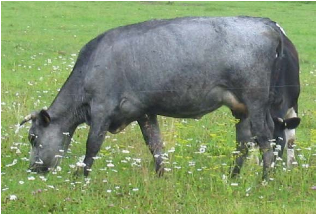
Figure 1 A grey cow from the Vahtramäe farm in Estonia.

Eleven Estonian grey cattle individuals from different stocks were blood-sampled. Particular efforts were made in all cases, using both the limited pedigree information (e.g. mostly only parent-offspring and full-sibling relationships) available and the knowledge of local herdsmen (e.g. the farm or village where the cattle originate from and the previous owners) via the interview questionnaire, to ensure that the animals were unrelated and had characteristics typical of the