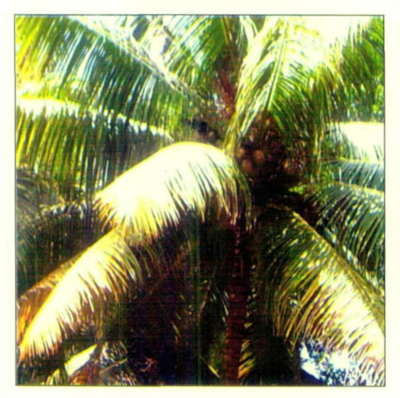
(c) Drying of leaflets from margin