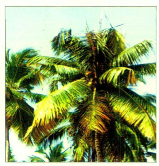
(d) Breaking tips of fronds

Fig. 1. Progressive development of symptoms in palms affected by Weligama Coconut Leaf Wilt Disease (WCLWD)