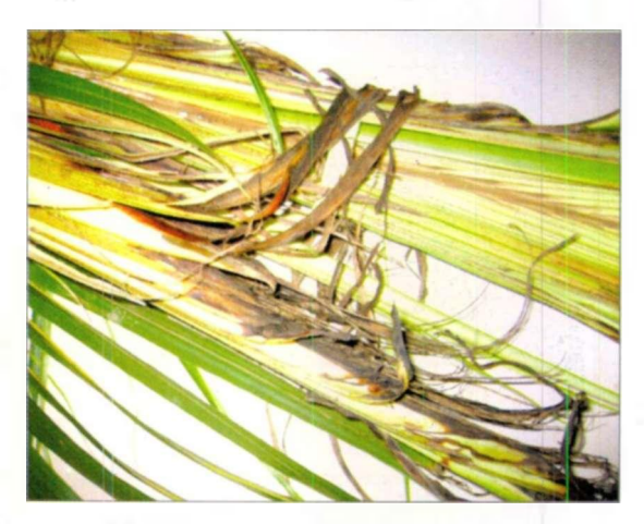
(b) Affected fronds of adult palms