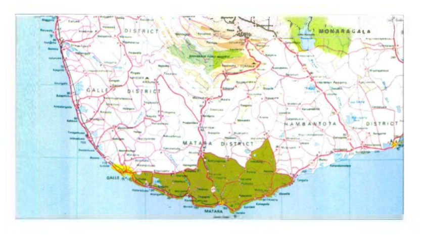
Fig. 3. Map of Sri Lanka showing Weligama coconut leaf wilt disease (WCLWD) affected areas in the Southern Province

black and fall off, while partially affected leaflets with blackish shriveled tips, and fronds with completely rotten leaflets appear as blackish "fishing rods" (Fig. 4). The fungi responsible for the leaf rot disease are Ceratocystis paradoxa , Colletotrichum gloeosporioids and Fusarium solani (Fernando et al. , 2002). Currently leaf rot disease is found in all areas where WCLWD prevails. Most of the leaf rot affected palms had