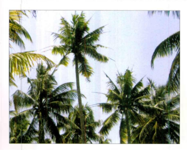
(a) Rotten leaflets of affected bud leafFig. 4. Symptoms of Leaf rot disease in coconut

flattened leaflets as in the case of WCLWD but yellowing and marginal necrosis could not be observed as the part of leaflets are already rotten.