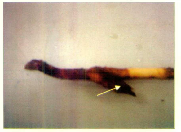
Fig. 1. Progressive development of symptoms in palms affected by Weligama Coconut Leaf Wilt Disease (WCLWD)