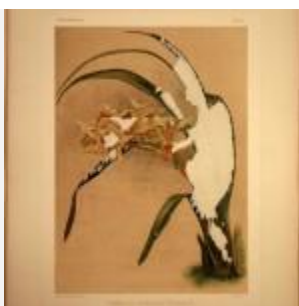
Cymbidium winnianum before treatment, paper is adhered to a large portion of the image surface.