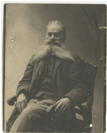
Studio portrait of Jovan Dragašević