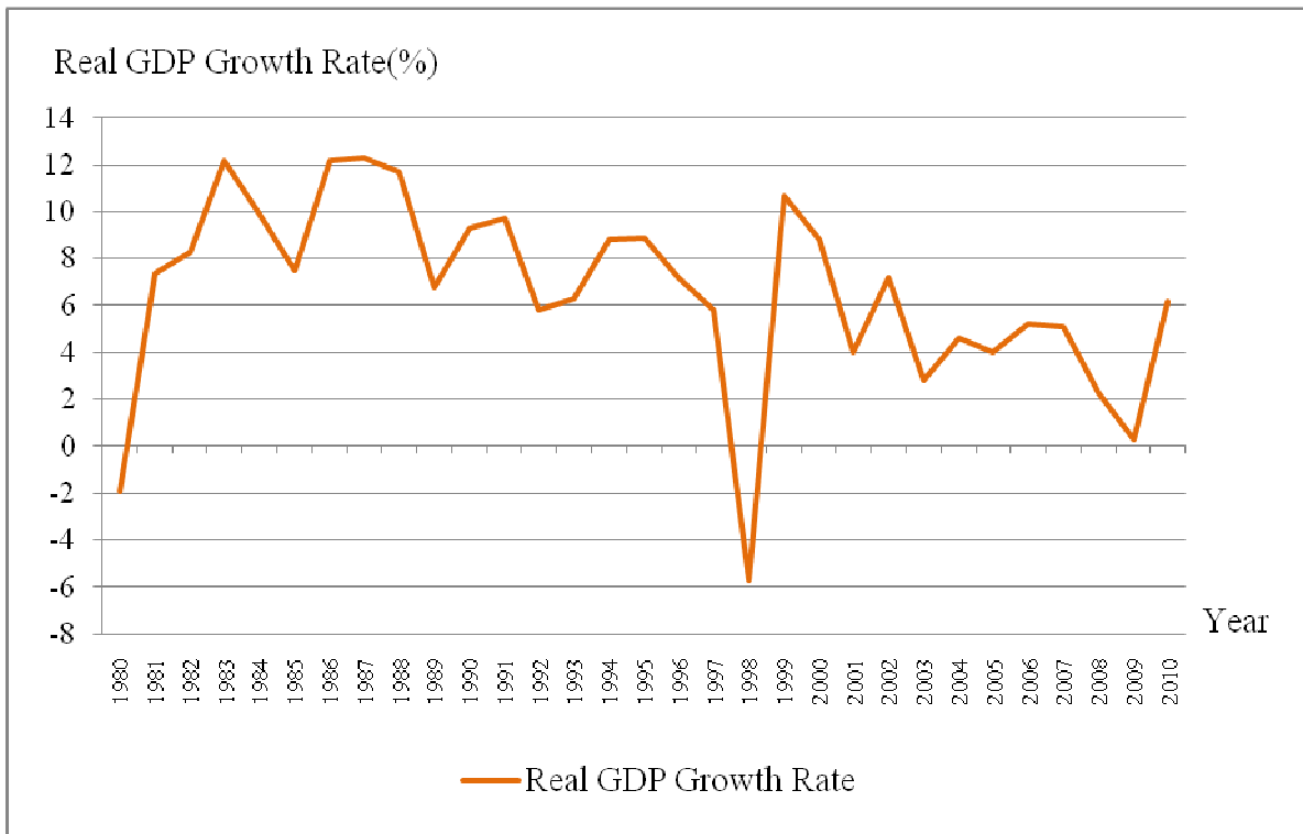
Figure 1 Real GDP Growth Rate