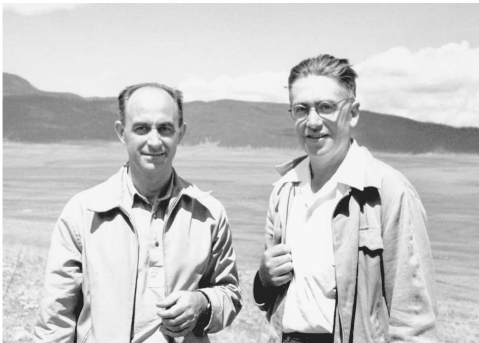
Figure 2. Fermi and Segrè at Los Alamos in 1945.