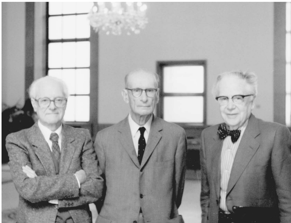
Figure 3. Amaldi, Rasetti, and Segrè in their old age.

but by then it was clear that Pontecorvo’s defection had enormously deflated their bargaining position. Withdrawing the compensation claim entirely at this point would have looked rather suspicious. But clearly the PCB was ready to use recent developments to turn negotiations in its favor. The inventors were well aware that it was time to accept whatever conditions were offered; they were eager to settle the matter quickly and at any price.