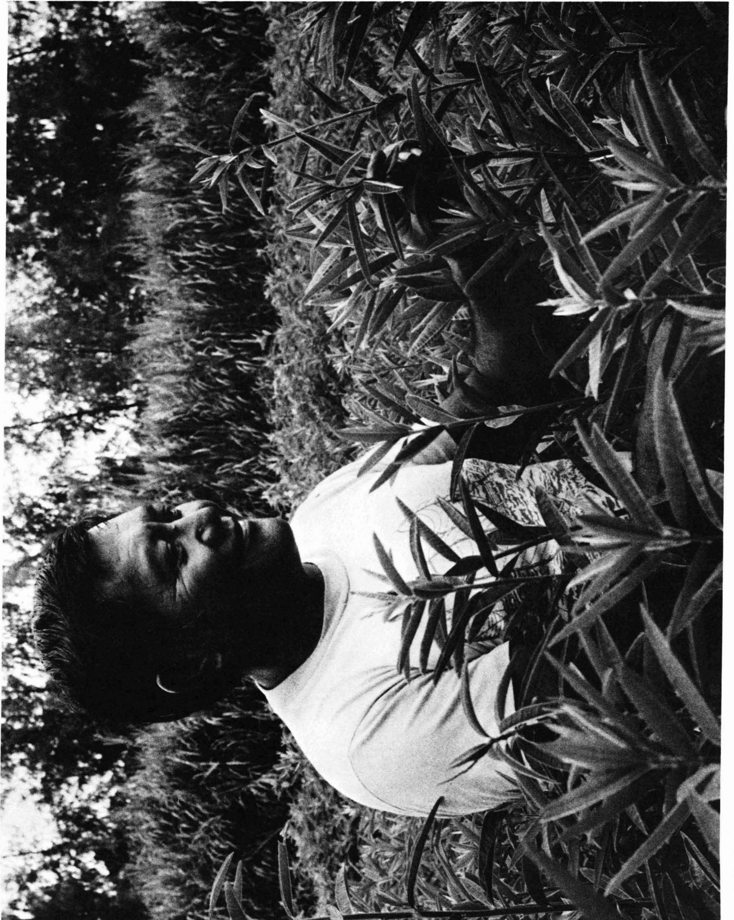
Figure 1. 'Tropic Sun' sunn hemp at 50 days of age.