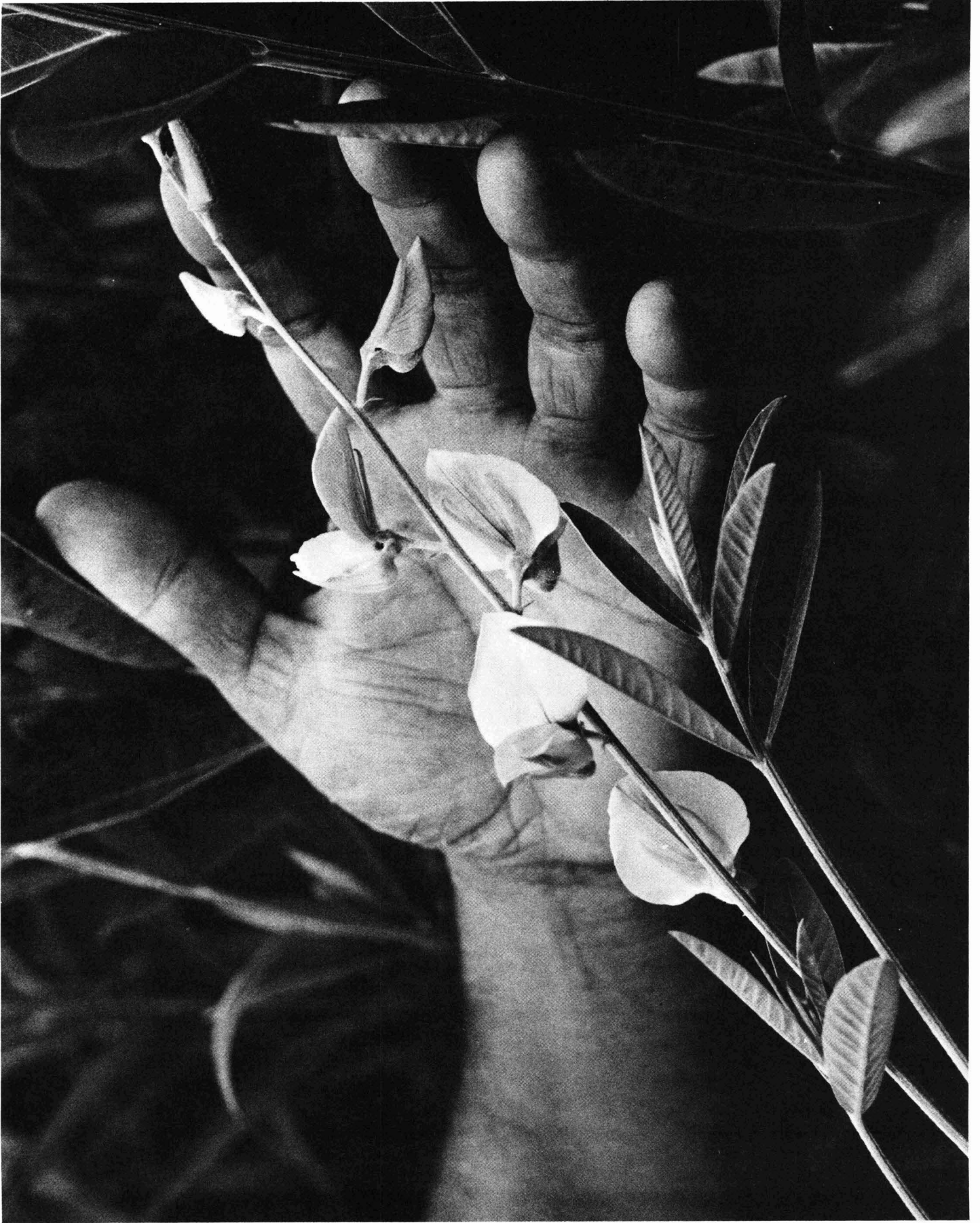
Figure 2. Flowers of 'Tropic Sun' sunn hemp.