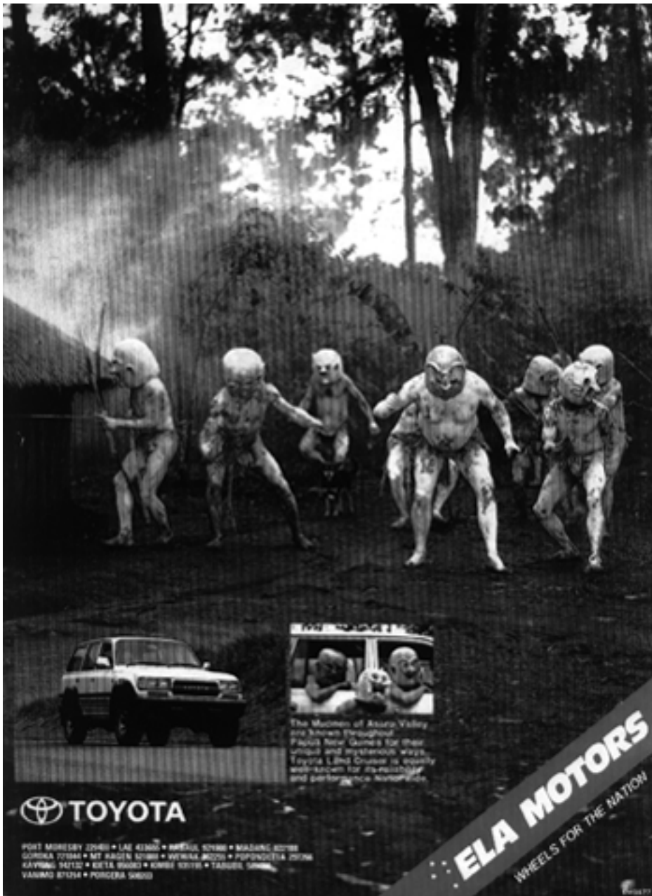
FIGURE 7. A Toyota advertisement taken from the back cover of the Air Niugini in-flight magazine. ( Paradise 89, November–December 1991)