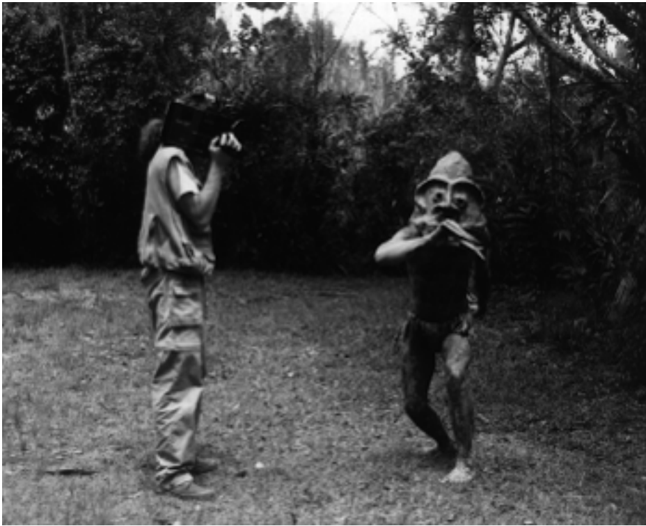
FIGURE 5. A Mindima Mudman filmed by one of the authors.

coconut shells on their heads—must be regarded as a competitive arena for cultural creativity and an important dynamic force in ongoing processes of cultural transformation.