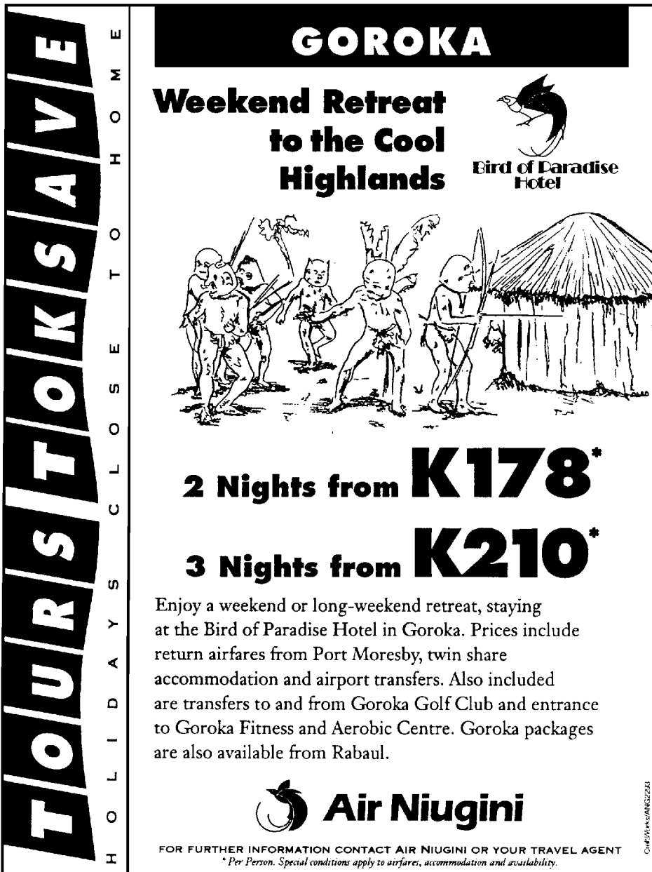
FIGURE 1. An advertisement for a short holiday. ( Times of Papua New Guinea , 2 July 1992, 5)