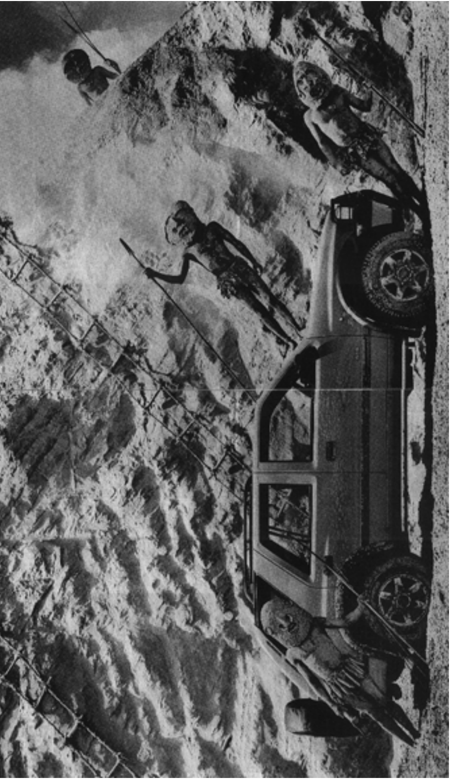
FIGURE 2. A two-page car advertisement. ( The Independent on Sunday , 23 April 1995, 28–29)