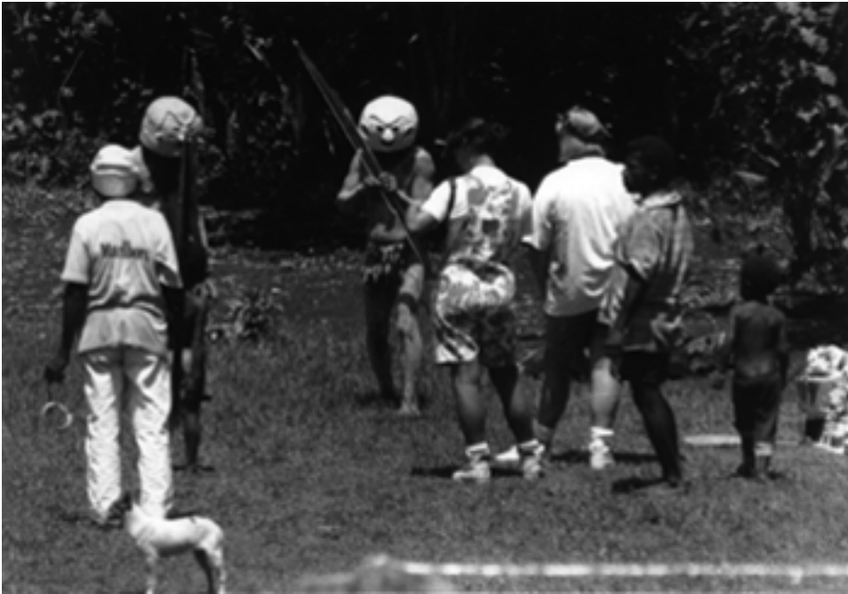
FIGURE 4. A typical mudmen performance in Komunive village.

Innovations to the mudmen experience were added from the outset. They include traditional fire making, via friction and dry grass, and a bow-and-arrow-shooting competition that is always heavily attended, not only by the mudman performers but also by other villagers who appreciate the notion of an easily pocketed two kina, which is the prize for the