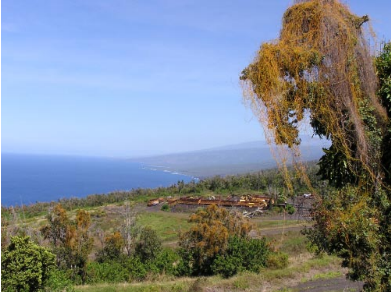
Cassytha filiformis is spreading along the roadways of the South Kona coast of the island of Hawai'i where lands have been bulldozed and developed. Here, C. filiformis is a parasite of 'ohi'a lehua ( Metrosideros polymorpha ) and other plants, creating an eyesore in landscapes.

tial human health applications. For instance, ocoteine, a compound isolated from C. filiformis , was found to be an alpha 1-adrenoceptor blocking agent in rat thoracic aorta. This type of chemistry has potential applications for inhibiting certain carcinomas such as prostate cancer. Octoeine and a number of other compounds in C. filiformis have antiplatelet aggregation activity.