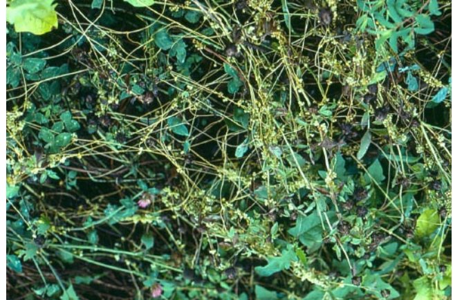
Cuscuta campestris on the legume white clover ( Trifolium repens ); both species are introduced to Hawai'i.