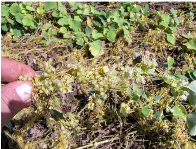
Cuscuta sandwichiana on 'ilima ( Sida falax ); both species are endemic to Hawai'i.