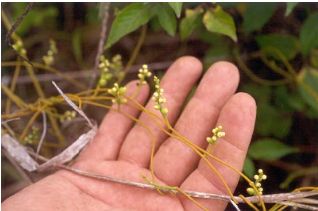
Flowers of Cassytha species (also known as “dodder laurels”) occur in spicate or racemose clusters; these plants tend to climb up and parasitize larger woody plants and shrubs.