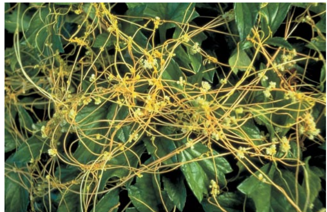
Flowers of Cuscuta species (dodders) occur in cymose to globose clusters; these plants tend to spread across and parasitize herbaceous plants at ground level.