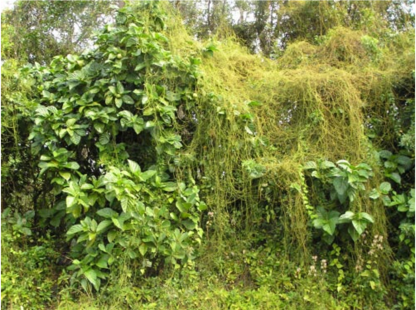
Cassytha filiformis enshrouding and bridging noni ( Morinda citrifolia ) plants in the coastal Puna district on the island of Hawai'i.

lular nutrients and water from plant phloem and xylem. Even though the haustorium is an intracellular structure, it is not in direct contact with the host cell cytoplasm. In the case of phloem tissues, the cells of the plant host and the pathogen are separated by their respective cell membranes. Nutrients and fluid pass through these membranes. After the haustorium directly penetrates the cell wall, the haustorium does not penetrate or break through the plasmalemma membrane, but rather invaginates it.