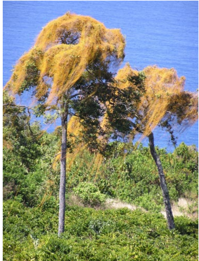
Cassytha filiformis on Metrosideros polymorpha ('ōhi'a) on the South Kona coast, island of Hawai'i

The two Cuscuta species in Hawai'i and C. filiformis are sometimes confused. In fact, they are all nowadays sometimes referred to by the same name in the Hawaiian language, kauna'oa. This fact calls into question the accuracy some of the reported host ranges found in the