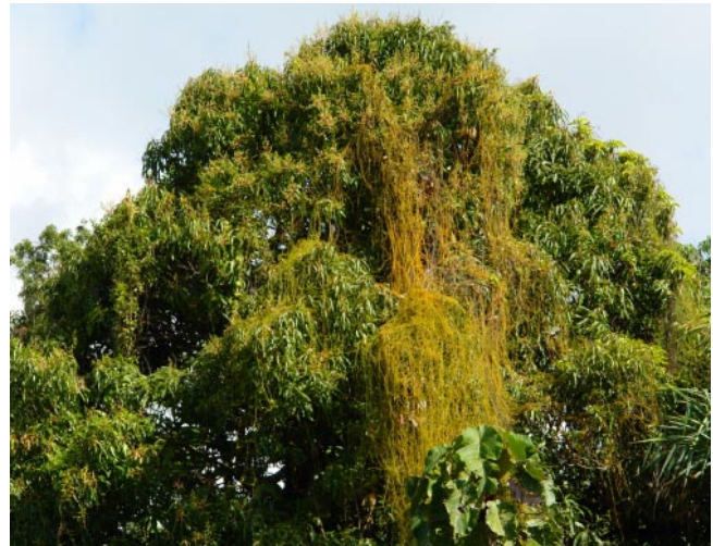
Cassytha filiformis on mango ( Mangifera indica ), Hilo International Airport

Human practices associated with the spread and increased severity of C. filiformis infestations include air travel ( C. filiformis is a common parasite around airports