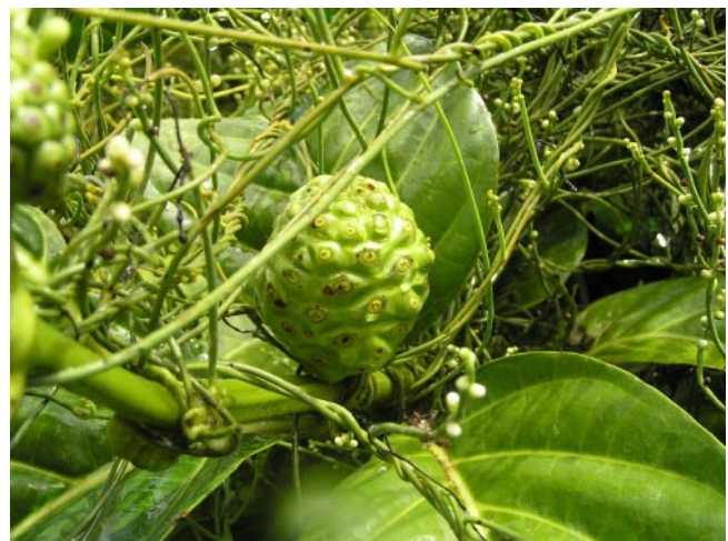
Cassytha filiformis on noni ( Morinda citrifolia ), in the coastal Puna district, island of Hawai'i