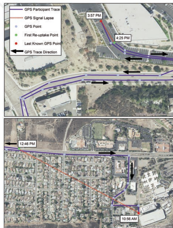
Figure 1. Examples of geographic positioning system signal lapse.

Data for land use in San Diego County were downloaded in 2014 from San Diego Geographic Information Source - JPA/San Diego