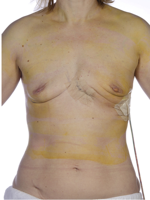
Figure 2. The day after surgical drainage of PAAG from the left breast (April 2012).