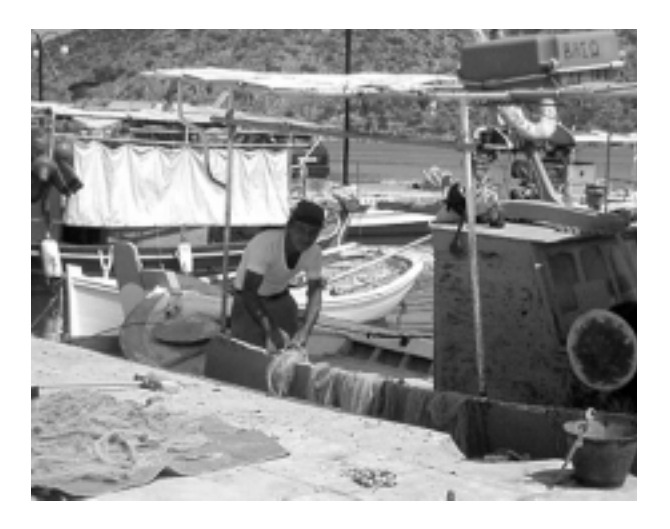
Figure 1. Greek fishermen of coastal fisheries performing after-docking activities in the harbour of Koilada in Argolis, Peloponnese, Greece

The occupational risk factors are very similar to those seen in Polish small-scale fisheries [8] and include: a) small working area inside vessels, b) the specific nature of each fishing method, c) the use of unsuitable or badly maintained fishing equipment, d) the extreme weather conditions combined with