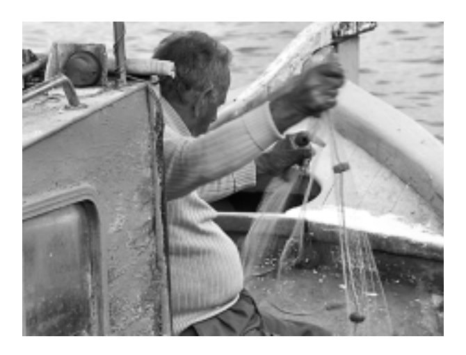
Figure 3. Old Greek fisherman, untwisting a net. His appearance is an excellent example of some important occupational health risks, like increased waist implying body mass index higher than normal, tanned skin after sun exposure, inducing skin aging, and small working surface causing limitation of movements in a small fishing vessel of coastal fisheries

At the end of the day, Greek fishermen, who work mainly in family-based fishing enterprises, form small groups of crew members and they consume large amounts of alcohol combining it with fatty meals,