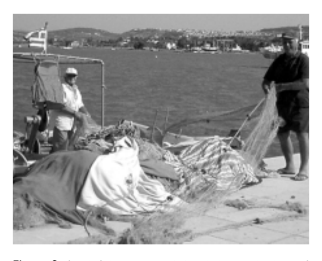
Figure 2. Greek fishermen untwisting their nets. Harbour of Koilada in Argolis, Peloponnese