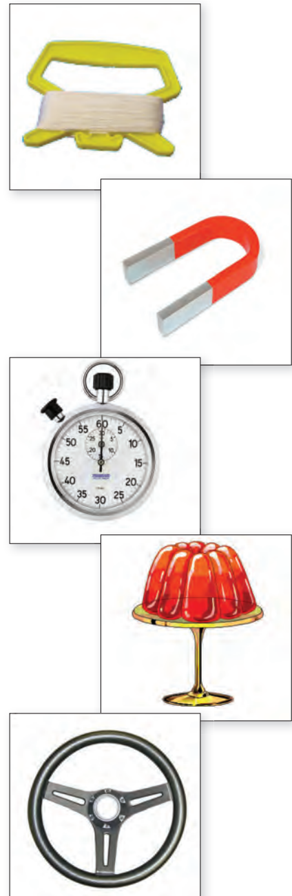
Figure 3. Examples of picture cards of handles, instruments and tools used to trigger conversations about relating between business partners.

These experiments came about because of a concern that the value network mapping technique may lead to emphasis on nodal connections by symbolizing relationships with static materials – as if relationships can be switched on or off independent of the agents in question. It may be easy to connect symbolic objects with lollipop sticks, but the skill and sweat involved for both parties in building a business relationship is obscured. Relationships are constantly evolving and often asymmetrical in terms of power and