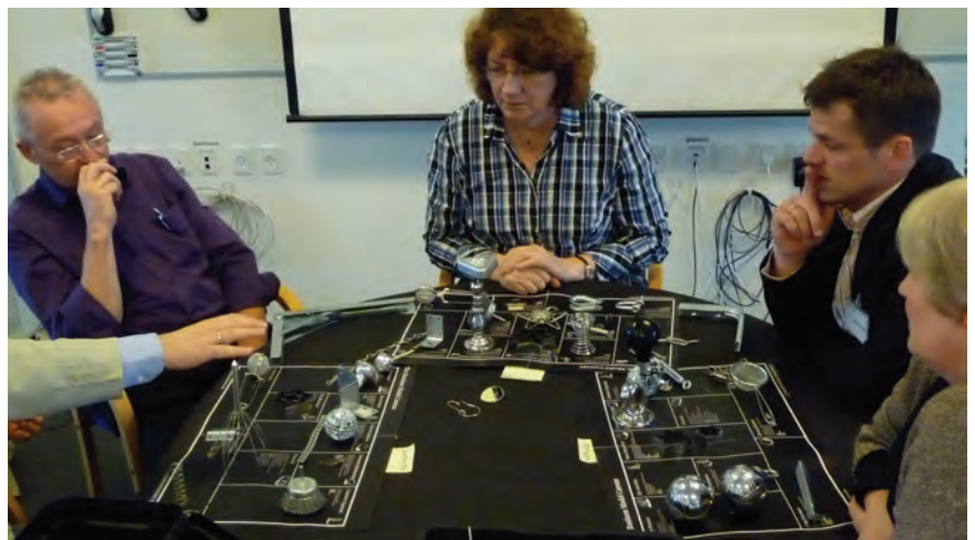
Figure 6. Participants from the ventilation systems manufacturer, its customer and its supplier use silver bric-a-brac to link their three business model canvasses and discuss mutual interdependencies.

By studying video recordings of these sessions, we have shown that participants typically identify one particular salient property of an object and then use that property to create a metaphor about the organization's situation (Heinemann et al. 2011). We categorize the different kind of properties invoked into three: physical , kinetic and iconic . What particular property is invoked varies according to aspects such as the context in which the objects are placed and whether the object lends itself better to being interpreted in one way or another. Our research suggests that participants, through working with tangible material in fact have a large variety of different paths available to them; paths that affect the narration that is the end-result of these workshops. Participants tend to use the salient properties of objects in very similar manners, namely to create metaphors with what we call 'negative associations'. In other words, the end result, independently of what object is being used and of what property of that object is invoked, is the creation of a metaphor that portrays an organization's relations as fraught with matters of power differences, competition, struggles (Heinemann et al. 2011).