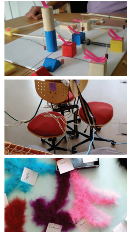
Figure 2. Three variations of material used for building tangible value network maps: tinkering bric-a-brac, life-size materials and starfish-like objects.

We have experimented with a range of material variations to see how best to support the team discussion on value networks (Heinemann 2011), Figure 2. 1. Bric-a-brac tinkering material. Although many different materials work (coloured wooden bricks, foam pieces, even organic materials), we have found that business people respond well to a professional looking kit of similarly coloured objects deployed on a surface with a contrasting colour. Objects, which are too heavily coded (animals, figurines), tend to focus the discussion