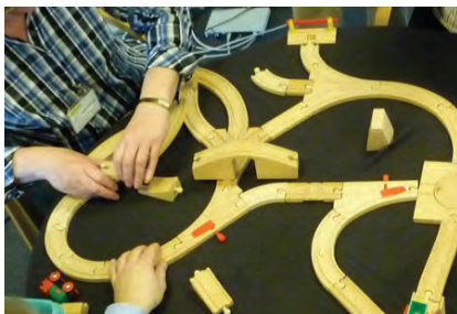
Figure 9. Plastic tubes & balls and a wooden toy train set as toolkit for modelling business dynamics. Company representatives discuss the business model could change in a situation where system manufacturer, building contractor and components suppliers combine their efforts.

levers of the device remind them of. This elicits a conversation where participants finds ways of expressing what we could call the business logics of the company: ‘If I do this, then...’ or ‘The more I turn this, the more...’