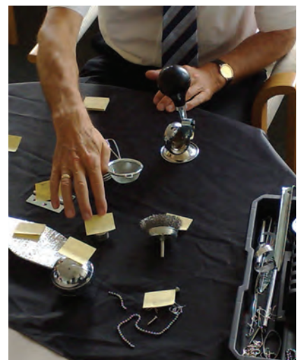
Figure 1. Tangible value network mapping with 'The Silver Set', a collection of silver coloured bric-a-brac on a black tablecloth. Managers discuss how a small electronics manufacturer may introduce a new technology to a particular market segment.

tion of action research and interaction analysis. Action research in the sense of repeated experiments in settings that have an actual purpose of innovating their business (Brandt 2005). As researchers we facilitate the event and include partners in reflecting on the viability of the techniques afterwards. The sessions are video recorded for later detailed analysis of the interactions between participants and with the material offered. We rely on the ethnomethodological method of conversation analysis (Heritage 1984).