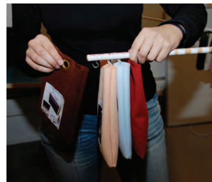
Figure 8. The Sales Effort Balance. A tangible business model developed for a lighting component manufacturer. A suspended Dowling pole represents the balance between sales resources and development resources. A set of filled cloth bags of different weights allow participants to experiment with adding different types of tasks and investments to achieve a balance.