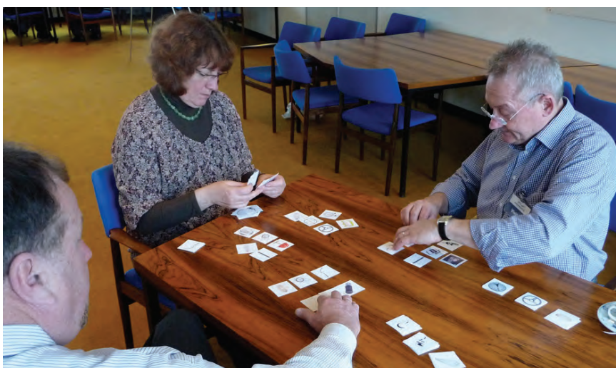
Figure 4. Representatives from a ventilation systems manufacturer, its customer (building contractor) and supplier (electronics manufacturer) use picture cards to discuss how they relate to each other in daily business.

An important goal for research here is to understand how the picture cards facilitate a change in conversations about relating, and which importance this has for innovation. We hope to be able to report on the interaction analysis of video documentation of the picture card activities at a later point.