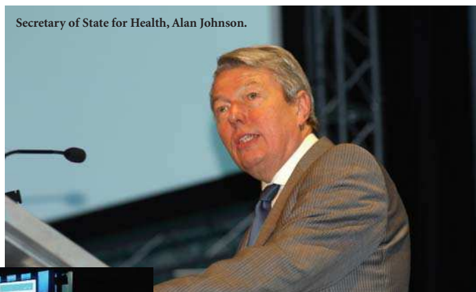
Secretary of State for Health, Alan Johnson.