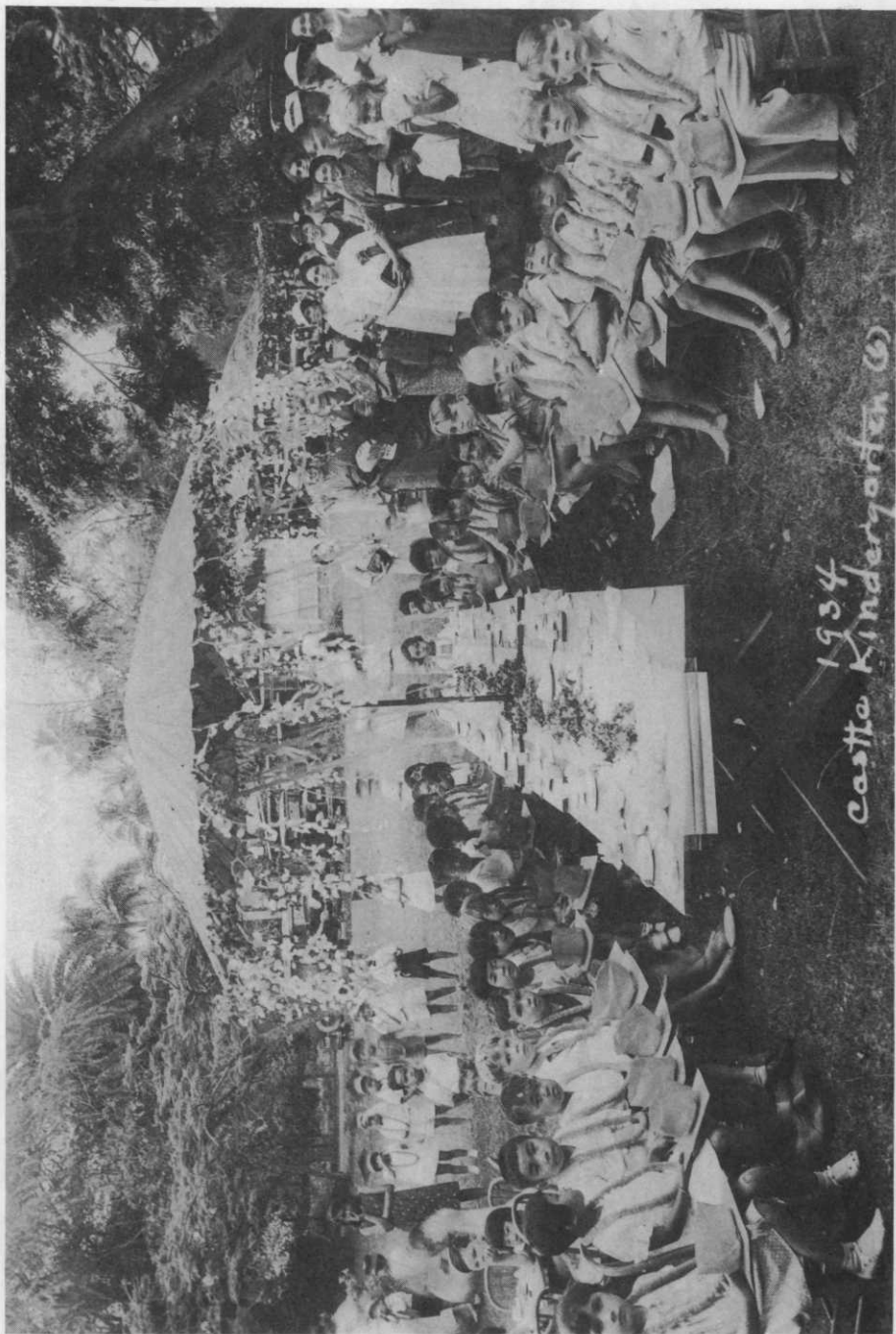
Castle Kindergarten © 1934