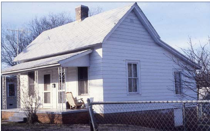
Historic residence within the Woodside Cotton Mill Village in Greenville.