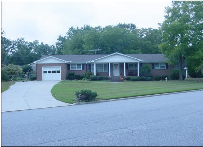
Typical residence rehabilitated by GCRA (Mauldin, SC)