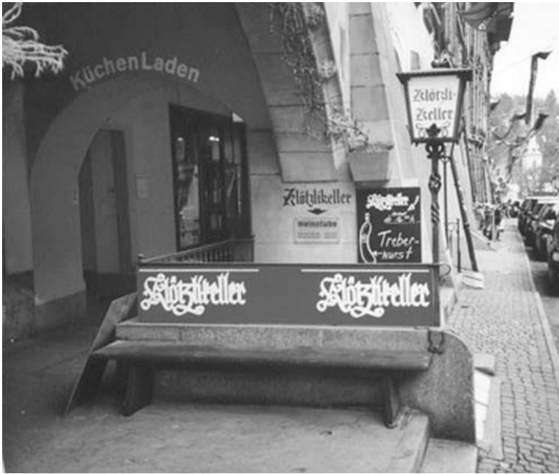
Figure 2: The Klötzlikeller on Gerechtigkeitsgasse is the sole surviving early modern cellar tavern in the City of Bern. According to a (conservative) estimate in Heinzmann, Beschreibung der Stadt und Republik Bern , vol. II, 72, burghers sold wine in 145 such establishments – traditionally identified by a pole with fir twigs protruding from the entrance – in the late eighteenth century. In addition, of course, regular inns and craft hostelries vied for custom.

as well as visitors (Figure 2). 17 On top of licensed and customary civic provision, furthermore, many towns granted additional catering rights at times of extraordinary demand. In the small market of Laupen near Bern five artisans –including the butcher Johannes Schlatter – were allowed to set up temporary outlets during the spring and autumn fair of 1753. Some time later they accounted for a turnover of no less than 2,200 litres, about a quarter of what the regular Bear inn used over a whole year. 18