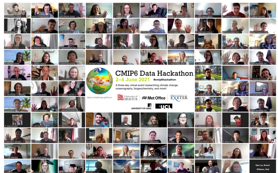
Figure 1. Group photo of the CMIP6 Data Hackathon Participants that took place virtually from 2 to 4 June 2021.

Project 1 focused on sea level rise (SLR), one of the more certain consequences of global warming. However, predicting the amount of future SLR is complicated because multiple different parts of the climate system play a role, each of which has a different sensitivity to external forcing and a different time constant for a response. Typically, each component – glaciers, ice sheets, land hydrology and thermal expansion of sea water – has been calculated separately and summed to produce a global estimate. A different approach examines the response of sea level to a centennial change in temperature from both historical observations and climate model projections, termed the transient sea level sensitivity (TSLs). A recent study estimated the TSLs for the IPCC Fifth Assessment Report (AR5), the Special Report on the Ocean and Cryosphere in a Changing Climate and historical data (Grinsted and Christensen, 2021). Some CMIP6 projections, however, have a greater sensitivity to greenhouse gas forcings than previous climate models (e.g. Zelinka et al. , 2020) potentially affecting the TSLs. This group