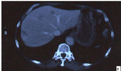
Figure 1 Microscopy and Endoscopy pictures at diagnosis in November 2001. a: shows pictures of H and E staining, b: KIT positive staining c: Endoscopic findings.

more than 10 mitotic activities per 50 high power fields (HPF) (Figure 1a). The tumour was found to be positive for a deletion mutation in exon-11 (of the c-KIT exon) (Figure 1b). Computerised tomography (CT) of the abdomen showed multiple metastatic deposits in the liver (Figure 2a). At laparotomy the tumour was found to involve the liver, pancreas and omentum. A hard lump in the right paracolic gutter was inseparable from the right kidney. Owing to the extensive nature of the disease the abdomen was closed without any resection.