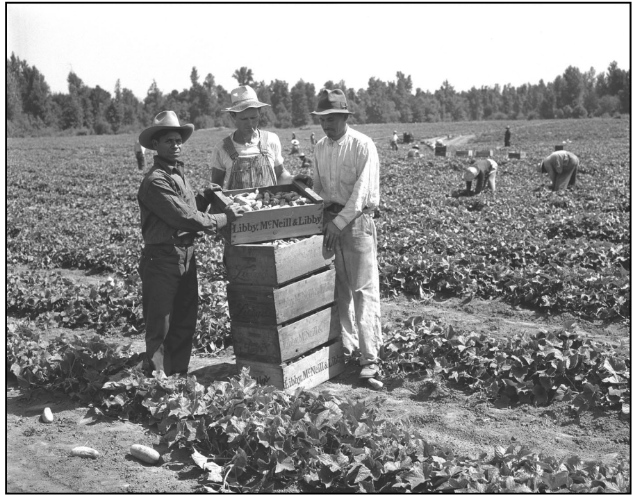
Boxes of Cucumbers

The photographs remained in the Extension Service's voluminous photo files for many years. In the late 1960s and early 1970s they were transferred to the University Archives, which had been established in 1961. The Braceros in Oregon Photograph Collection ii is an artificial collection; the original photographs (prints and negatives) were drawn from a number of our Extension Service's related photograph collections. They include the Extension Bulletin Illustrations Photograph Collection (20), the Extension and Experiment Station Communications Photograph Collection (120), the Extension Service Photograph Collection (62), the Agriculture Photograph Collection (40), and Harriet's Collection. iii