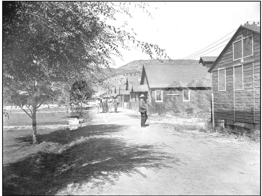
Klamath County Camp

communities, and there were little few to no organized social activities (Gamboa, p. 177–178). If the Bracero workers had been able to interact with the local community, it may or may not have been welcoming. Community support for the Mexican labor forced fluctuated, as evidenced by numerous newspaper articles which sometimes stating that hiring non-locals was unpatriotic while and at other times praising the Bracero Program for the needed labor assistance. In order to promote the program and assuage the fears of the community, the Extension Service in charge of the program created printed propaganda materials and even radio shows to champion the Bracero Program. 1 It was in part due to these efforts that we now have a printed and photographic record of Braceros in Oregon.