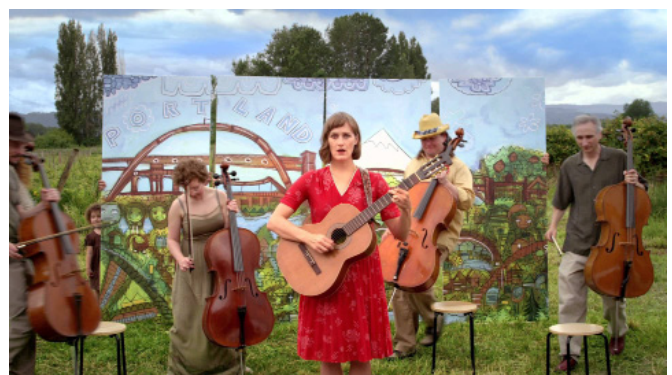
One of several ads for Cover Oregon ( http://youtu.be/Xv2UUcXC09g )

musicians to write the music and lyrics for these ads was deliberate. Many musicians are self-employed and uninsured, and have significant enthusiasm for finally qualifying for health care under the Affordable Care Act.)