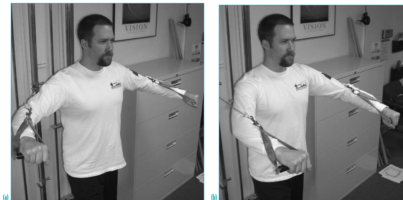
Figure 5 Dynamic hug (a) start position and (b) bilateral humeral horizontal flexion.