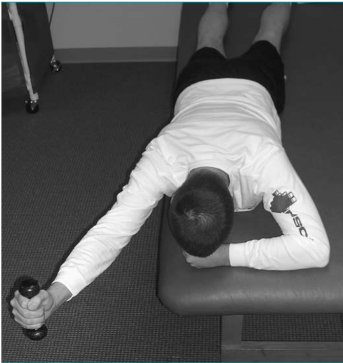
Figure 6 Prone overhead arm raise in line with the trapezius.