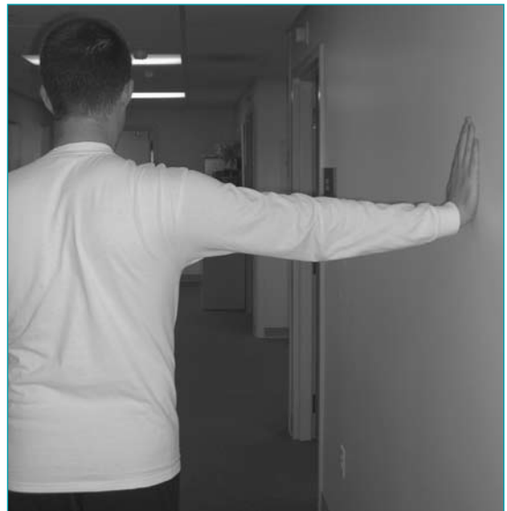
Figure 2 Scapular clock emphasizing scapular retraction.