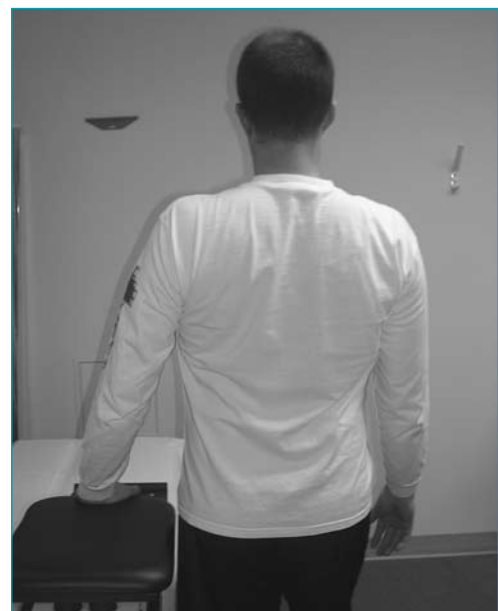
Figure 3 Low row exercise (start position).