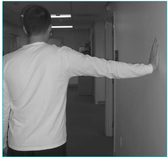
Figure 1 Scapular clock emphasizing scapular elevation.

As the athlete's scapular neuromuscular control improves, open-chain exercises may be initiated. Adding open-chain exercises can increase the endurance capacity of selected muscles, and they can be performed incorporating the entire kinetic chain. The shoulder-dump exercise should be prescribed to facilitate scapular retraction as part of kinetic-chain sequencing. 5 This exercise can be performed with the athlete's arm at various abduction angles depending on rehabilitation phase and sport demands. The exercise is performed with the athlete standing with the contralateral foot forward, the trunk flexed and rotated toward the uninjured side, and the contralateral hip flexed 5 (Figure 4[a]). Scapular retraction occurs in sequence as the athlete uncoils, shifting weight toward the ipsilateral foot and extending and rotating the spine toward the involved side 5 (Figure 4[b]). Performing many of the common open-chain scapular exercises provides the additional benefit of activating the rotator-cuff muscles. 9,10