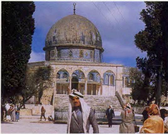
Above: the Dome of the Rock, in 1954, with the black lead of the dome clearly visible. The restoration of c. 1000 C. E. replaced the original gold with black lead, which remained for almost 1000 years. The yellow-toned anodized aluminum panels of King Hussein of Jordan's first restoration in 1964 can be seen in the cover photo.