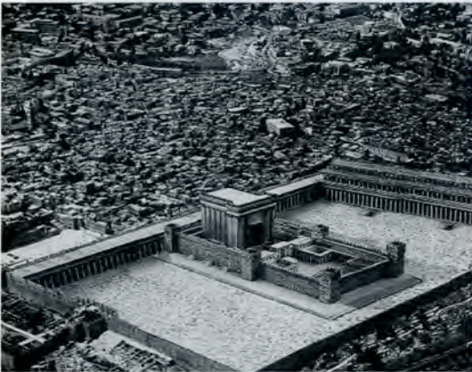
A poster purchased in the Jewish Quarter of the Old City of Jerusalem. The image is a clever photo-montage showing a photograph of the old walled city of Jerusalem with the Dome of the Rock and all other monuments of the Haram al-Sharif replaced with a model of the Third Jewish Temple. Radicalized right wing religio-political groups constantly seek to begin the re-building of the Temple destroyed in 70 C. E. With the goal of rebuilding, more than forty attempts have been made to destroy the monuments in the Sanctuary in the last fifty years.

A new wooden substructure, much closer to the original, replaces the aluminum ribs of the octagon. The concrete was removed with great difficulty and the roof covered with lead. A lining of wood covers the aluminum ribs of the dome over which are two layers of insulation to control heat and moisture, all of which are covered by gilt-plated copper panels. The initial test panels were too bright and needed abrasion to reduce the glare. The process involved plating the brass panels with a layer of pure copper; plating a layer of nickel over this; brush-plating a gold layer two microns thick. Quality control was achieved by computer testing to assure consistency in the thickness of gold. The new plates are smaller, ridged on all sides, and joined by ribs allowing movement, solving the problems of contraction, expansion and leakage.