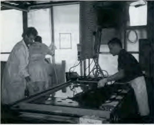
MIVAN, a Belfast Irish firm, produced gold panels. The workshop was on site beside the Dome of the Rock. This photo shows the pressure plating of 2 micron thickness of gold held in emulsion to panels which had already been plated with copper and nickel. Computer regulated quality control of the thickness of gold took place in an adjoining room.

The restoration provided the opportunity to examine parts of the building not normally visible. The tile window grilles of the dome drum removed for the restoration exposed the original Umayyad round-arched windows. The existence of holes in the stone on the sides of the arches suggests that, prior to the sixteenth century, there were originally metal, stone or marble grilles.