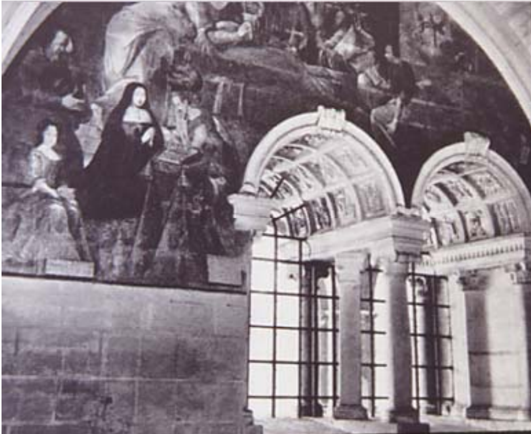
Figure 6. Chapter House of Grand Moutier, interior west wall, rebuilt by Louise de Bourbon, c. 1545 (Pohu 35). See also Figure 3 (Key Number 7).

Christ and the life of the Virgin, with, not surprisingly, herself along with past abbesses of Fontevrault portrayed as attendants at the various scenes. 22