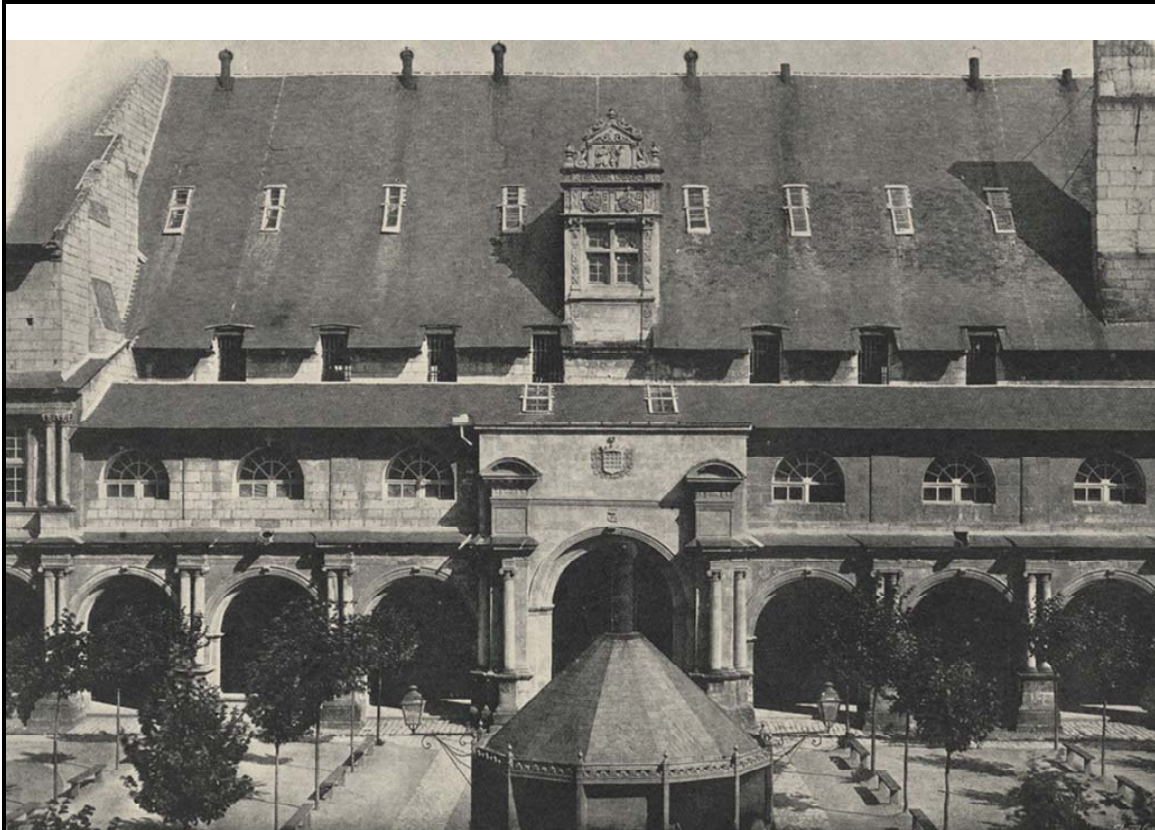
Figure 5. Cloister of Grand Moutier, eastern gallery, rebuilt c.1545 by Louise de Bourbon (Hallett 216). See also Figure 3 (Key Number 8).

Passing through this triumphal archway one immediately encounters the entrance to the chapter house, rebuilt by Louise around 1545. In keeping with the Gothic style of the cloister interiors, the chapter house portal is executed in an exuberant High Gothic style. 21 Five ranges of ornament surround the portal's pointed arch, including the evangelists, various religious symbols, floral motifs, and most significantly the monogram and coat of arms of Louise and the King of France. Having already received her papal dispensation, Louise used it with a vengeance, asserting her personality into the decorative program of every renovation she undertook. Inside the chapter house itself, Renaissance and Gothic elements are juxtaposed as dramatic ribbed groin vaults play against barrel-vaulted double windows with ionic and Corinthian columns and coffers carved with the signs of the zodiac. For the walls of the chapter house Louise commissioned frescoes depicting the passion of