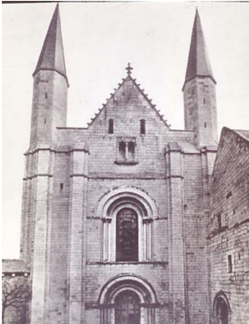
Figure 4. West façade of Abbey Church, c. 1104-1150, altered 16 th century (Pohu 14). See also Figure 3 (Key Number 5).

Pétronille's successor, Mathilde d'Anjou, completed the interior of the abbey church, including the Tomb of the Plantagenets in the southern transept chapel, and built the chapel of St. Benoît for her personal devotion towards the end of the 12th century. Both church and chapel display a limited but ornate decorative program in which engaged columns and piers carry historiated (i.e., figurative and narrative) capitals depicting lively saints, mythical creatures, and all manner of flora and fauna parading under abaci richly sculpted with checkerboard and zigzag patterns. 20 In the chapel of St. Benoît the nervous energy of the