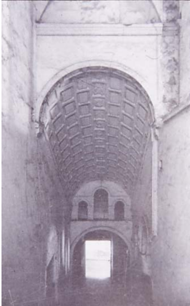
Figure 7. Great Stairway of Grand Moutier, leading to dormitory built by Louise de Bourbon, c. 1542 (Crozet 471). See also Figure 3 (Key Number 11).

The last of Louise's imposing projects was the enlargement of the staircase leading from the refectory to the dormitory in the southeast corner of the Grand Moutier. Now known as the Great Stairway, it dates from the late 1540s.