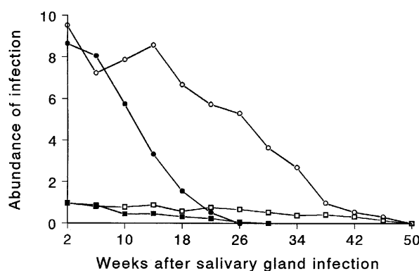
Fig. 2. Survival of Theileria parva Muguga in the highly infected nymphal Rhipicephalus appendiculatus Muguga after exposure to 20 °C and approximately 85% RH (—●—) or quasi-natural conditions (—○—) and that in the lowly infected nymphae exposed to 20 °C and approximately 85% RH (—■—) or quasi-natural conditions (—□—). Sixty ticks from each cohort were assessed at monthly intervals.

in infection level was not as steep as that of the highly infected nymphae kept under laboratory conditions. Further, there was a relatively longer drawn out period of T. parva survival in the ticks