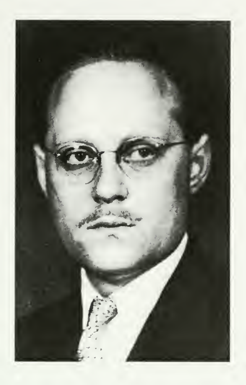
This volume is dedicated to the memory of