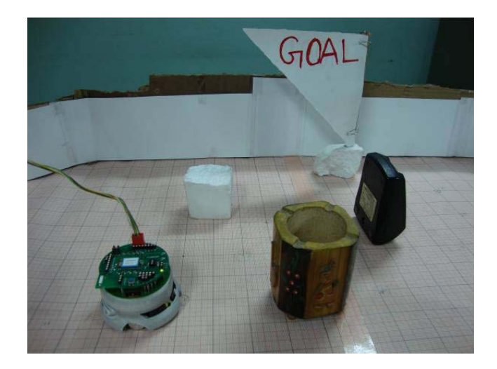
Figure 3. Environment setup for robot path planning

Extensive experiments were conducted to test the robot performance in path planning between any two positions i.e. START and GOAL position in the unknown environment with various unexpected obstacles. Figure 3 shows the environment set up of the path planning. The environment has three static obstacles of different shape and size. Figure 4 shows the snapshots taken at different stages of the Khepera II mobile robot path planning in one such case study. Figure 5 gives the grid map representation of the path planning by the mobile robot for the environment shown in figure 3.