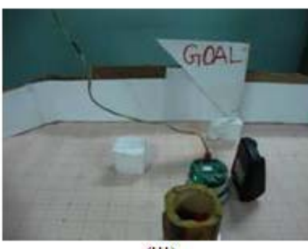
Figure 5. Robot path planning in a Grid map environment