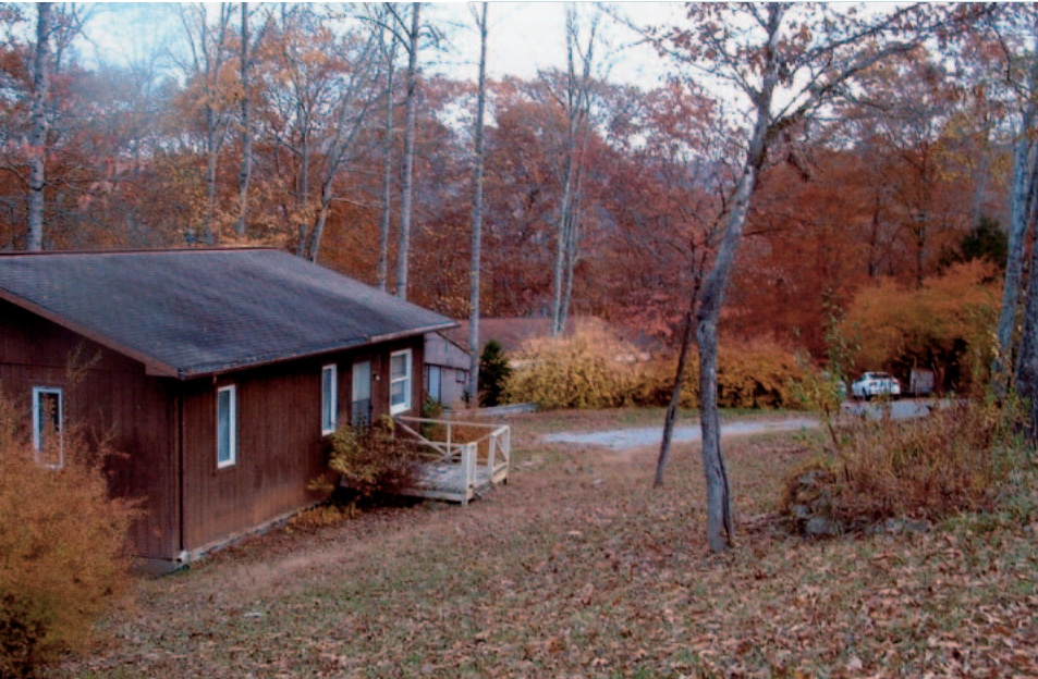
FIGURE 2 The first Land Trust house, designed by the Federation of Appalachian Housing Inc. The lower house on the right is a typical Tennessee Valley design. Mortgage financing for the Land Trust house came from the Churches.

“When poison escapes from the mines, the birds die and we humans take heed to fix the problem so that we may live. We who live in coal mining areas are, for our nation, what the bird is to the coal mining community. We belong to Earth. Earth does not belong to us. We are preparing for a post-industrial era and how we fade in and out of the real world is a challenge to all of us who dare to get involved.”