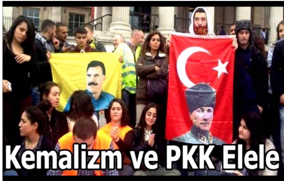
Figure 4. Anti-Gezi image.

The second most shared tweet of this camp used a shorter text and presented a video rather than an image, which was not a widespread video during the time of the protests.