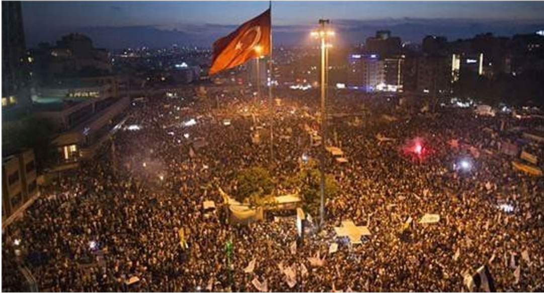
Figure 2. Crowd at Taksim Square, May 2013.

The second most shared tweet in our sample was by Erkan Baş on November 19, 2018. Baş is currently a member of parliament of the TIP party (Turkish Workers Party) who initially entered the parliament as an MP of the pro-Kurdish party HDP. During the Gezi protests, he was detained along with thousands of other protestors and he has an ongoing trial accused of being one of the leaders of the protests. Retweeted 242 times, his tweet aimed to show that the Gezi protests were a wider protest movement and that he was not a leader: