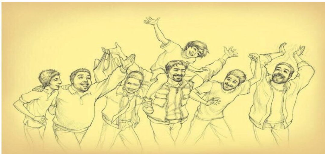
Figure 3. Gezi martyrs.

As an example, Abdullah Cömert's trial took place in May 2019 in Balıkesir, which is a little city in inner Turkey, where inhabitants predominantly vote for right-wing parties. Also, not so many activists live there and, therefore, not so many people participate in the trials. In isolating the trials from the wider public, the government hoped to remove the traces of the protests and justify the acts of killers in its renarration of the uprising. In using Figure 3 of the young people killed during the protests, the aim was to commemorate the losses visually and thus create "responsibility," hope, and solidarity across activists. The image has become a powerful icon for protestors to remember their dead, while serving to mobilize presence and solidarity in a desperate situation in which physical presence during the trials was challenging. Özcan (2013) argues that "visual images are much more than supplementary material accompanying the written message" (p. 428). The dead of the movement call on the surviving protestors to help their actual and potential prisoners. The visual image shows these young dead protestors as joyful, which is a powerful symbol of resistance to death and repression. A joyful commemoration of loss and death functions as a reference point for digitally remembering the trajectory and legacy of the protest movement.