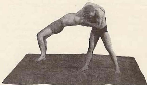
The "flying mare" or neck throw.

a somewhat similar throw, but in this case your opponent's hands are left free, and a good grip obtained of his neck;