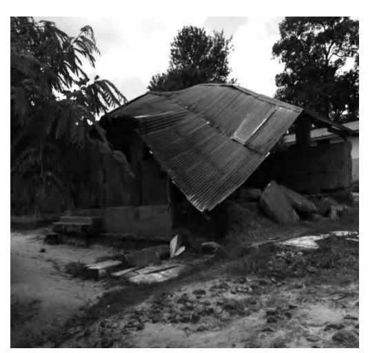
Figure 2: A collapsed school building. Fortunately nobody was hurt in this incident (illustration of the level of neglect)