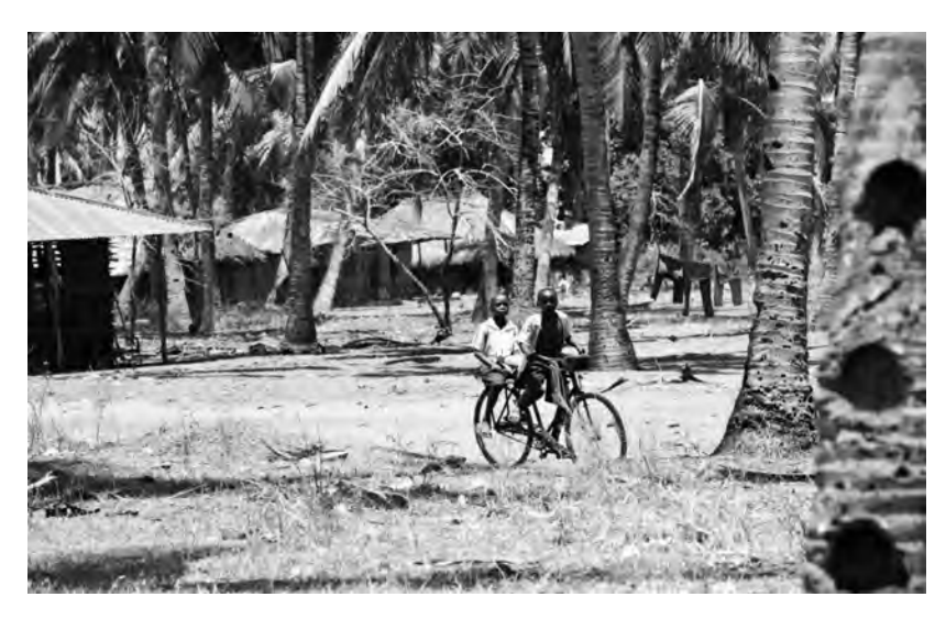
Figure 6: Clustered linear structure – these are not conditions where reading and writing can be central