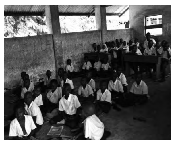
Figure 1: A classroom in which half the children had to sit on the floor and the other half on benches