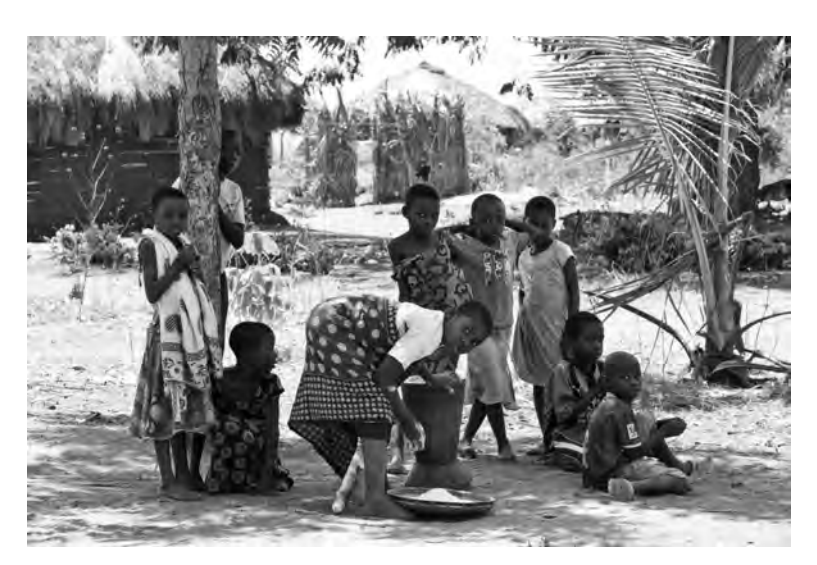
Figure 7: Despite few direct school literacy materials, homes were still full of vibrant contexts of socio-cultural knowledge that could be tapped into for school literacy