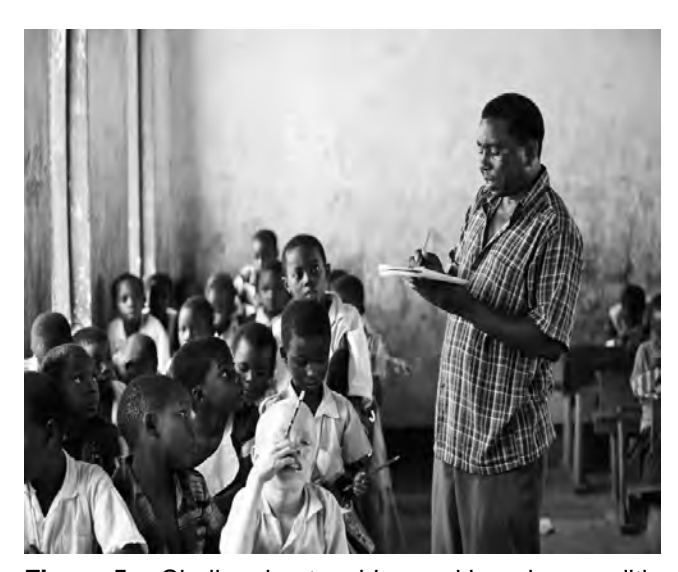
Figure 5: Challenging teaching and learning conditions for literacy development

Even with available teaching materials, teaching remained patchy with no full sentences on the board or full phrases based on prepositions as teaching points.