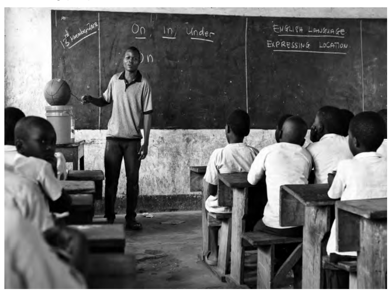
Figure 4: Literacy practices challenged

Even with available teaching materials, teaching remained patchy with no full sentences on the board or full phrases based on prepositions as teaching points.