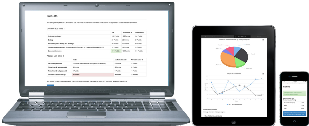
Fig. 1. oTree on different devices and operating systems.

on these devices. Third, the programming paradigm has shifted. It is now clear that open-source and industry-standard compatible solutions are a better fit for many scientific needs. Experimental software should use existing industry-standards wherever possible, be extensible and compatible with plug-ins and allow users to inspect the source code. oTree addresses these desiderata.