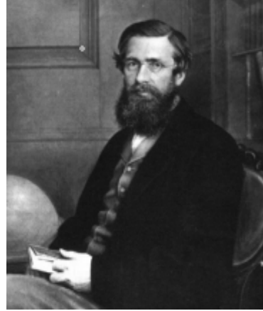
Alfred Russel Wallace

The previous chapter noted that Huxley, although he advocated Darwinism and rejected utilitarian design in explanation of organic form, may be considered a part of nineteenth-century teleological thought because he understood evolution developmentally and linearly. The fundamental proposition of evolution was, Huxley had stated, "that the whole world ... lay, potentially, in the cosmic vapour; and ... a sufficient intelligence could, from a knowledge of the properties of the molecules of that vapour, have predicted, say the state of the Fauna of Britain in 1869, with as much certainty as one can say what will happen to the vapour of the breath in a cold winter's day." 1 This remarkable