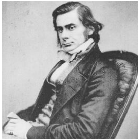
Thomas Henry Huxley

Chapters Two and Three studied the scientific and religious status of natural theology in Britain as Huxley, a prototypically positivistic and professionalizing “man of science” in Britain, would have found it early in his scientific career, before he was acquainted with Darwin’s views. That study is now complete except for a mention of the “ideal” or “archetypal” form of natural theology that was most nearly related to Huxley’s own scientific practices and