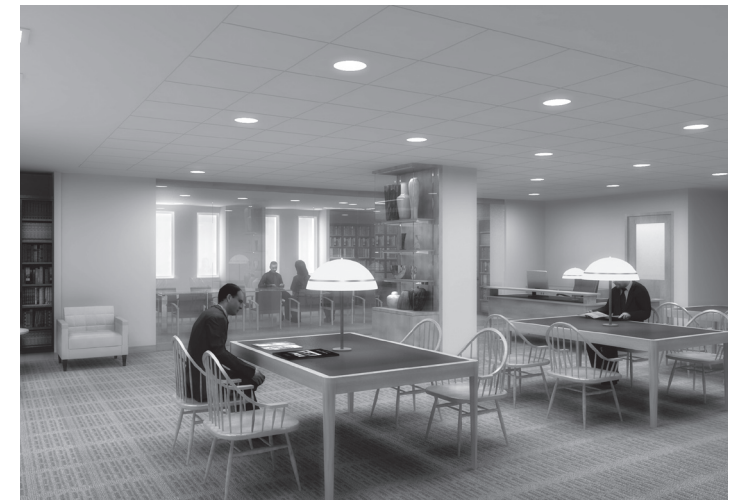
Architectural rendering of the Lear Center for Special Collections and Archives. Courtesy of Einhorn, Yaffee, Prescott.

By merging their locations, the new Lear Center will improve the efficiency of Special Collections and the College Archives, formerly on two different floors of the library. It will make it possible to support scheduled classes in the Palmer Room and to take care of researchers in the new reading room at the same time. The new facility will provide enhanced security as well as improved climate control and better conditions for the preservation of materials.