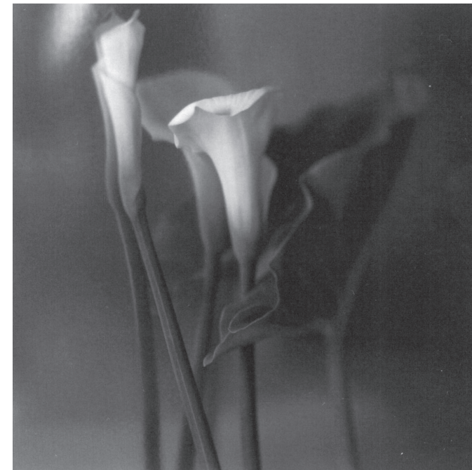
from The Shining Path. Courtesy of 21st Editions.