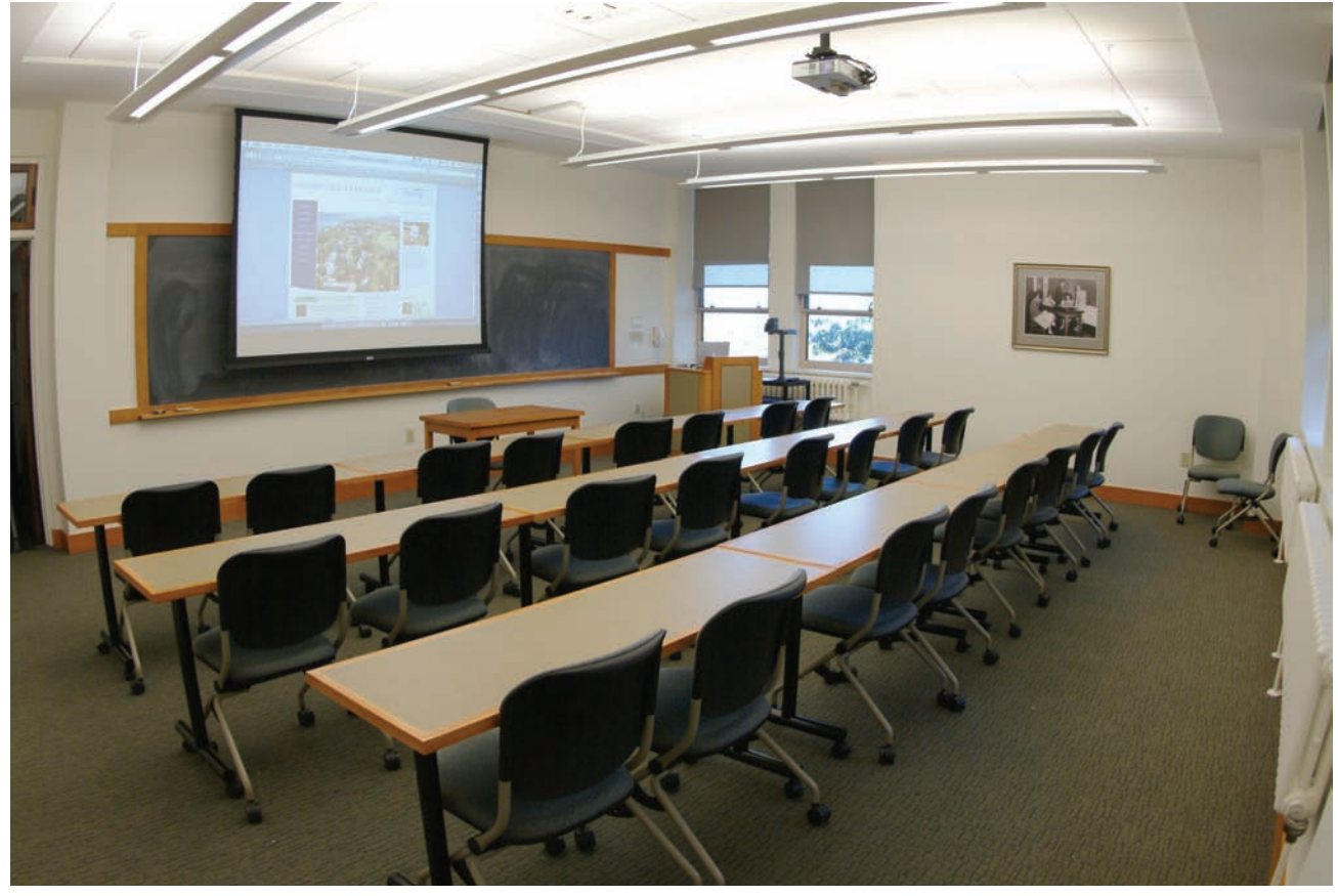
Bill 401 after renovation in Fall 2008