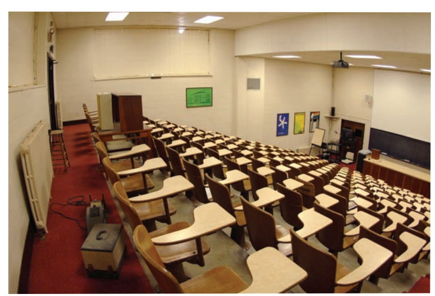
Bill 106 before renovation, Spring 2008

molding around the blackboard, and as decorative trim. Archival photos of the college, from the time the building was built, adorn the walls. One photograph, taken in 1939, shows Bill 106 just after it was completed. The other, taken in 1942, shows two students on the roof of Bill 106 serving as Civil Defense Spotters for New London during World War II. The frames for these image match the ones in other