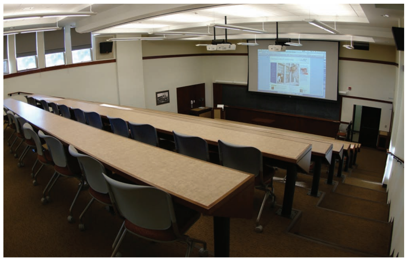
The Silfen Auditorium (formerly Bill 106) after renovation, Fall 2008