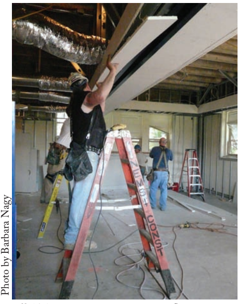
Bill 106 temporary construction floor as viewed from the back of the room. Summer 2008

The first photograph shows the temporary floor from the front of the room and the orange mechanical lift. The next photograph shows the temporary floor from the back of the room, where it appears as a normal floor. After the ceiling was completed, the temporary floor was removed so work could be done on the actual floor. The concrete tiers were retained, but