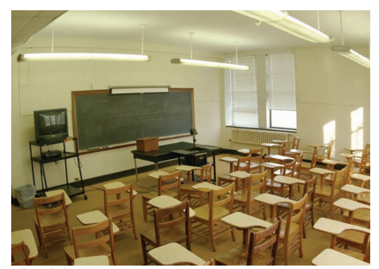
Bill 401 before renovation in Spring 2008

Bill 401 was renovated into a comfortable, updated lecture space. Tables and chairs on wheels provide flexibility. Typically, the tables face the front of the room for lectures, but they can be rearranged to form a seminar space to encourage discussion, or in smaller groupings to support group work.