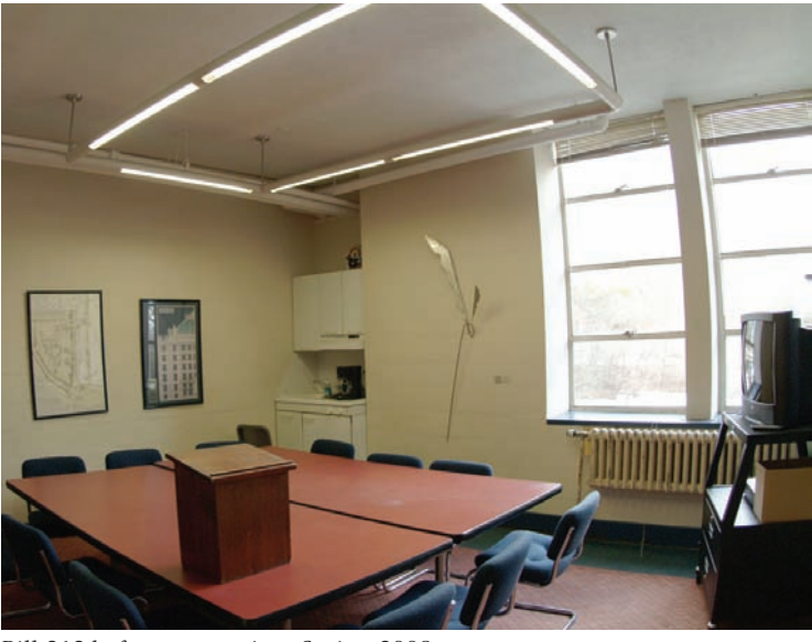
Bill 212 before renovation, Spring 2008