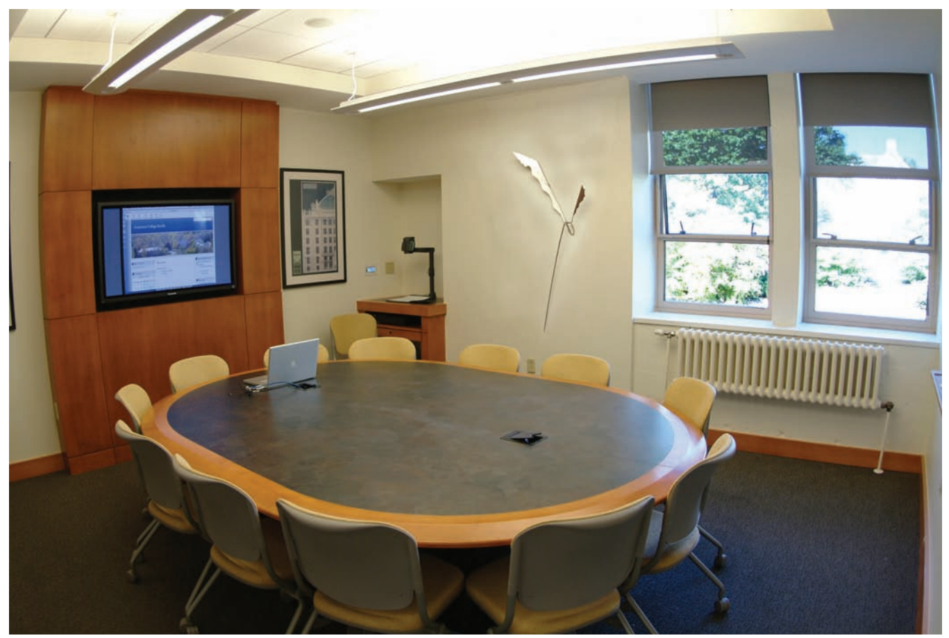
Bill 212 after renovation, Fall 2008