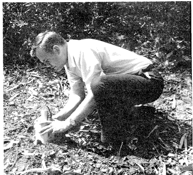
Seismometers for detecting microquakes along the San Andreas fault were originally designed to be landed on the moon to detect possible moonquakes.

Perhaps there is a correlation between them and other phenomena, such as earth tides and temperature changes. Ultimately, it is hoped that microquakes will help seismologists understand the mechanisms of large earthquakes.